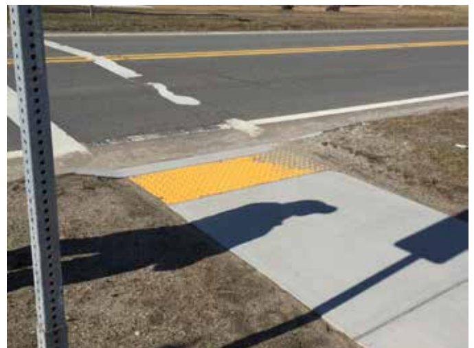
The newly painted crosswalk on Route 9 is already showing signs of wear.