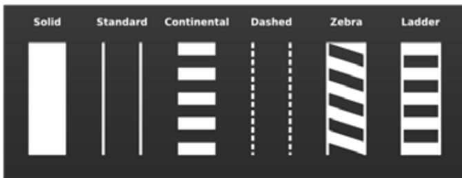
Crosswalk patterns

Crosswalks can be painted in a variety of ways, some of which are more effective in warning drivers of pedestrians. Crosswalks are usually accompanied with stop lines. These lines act as the legally mandated stopping point for vehicles, and discourage drivers from stopping in the middle of the crosswalk.