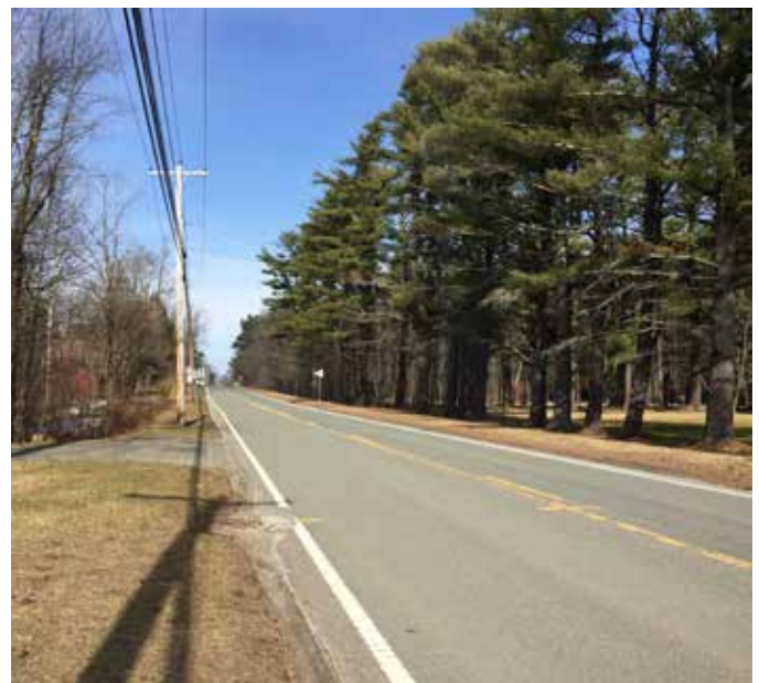
Route 9 has a 40 mph speed limit through Goshen. Residents believe that traffic routinely travels faster than 40 mph along this long straight-away north of the crossing.

Route 9 is one of the major roadways running through the Town of Goshen. It is state-owned, which means that MassDOT controls the design and maintenance of the road. The current speed limit between Ball Road and West Street is 40 mph. Even though we did not record speeds faster than 40 mph along Route 9 with our hand-held speed monitor, the fast-moving traffic made the walk feel uncomfortable, particularly when trucks drove by.