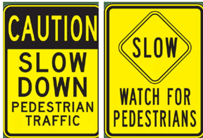
Examples of pedestrian awareness signs http://www.safetysign.com

Consider pedestrian lane markings or sidewalks along East Street to improve safety of residents walking to Tilton Farm and Goshen Recycling Center.