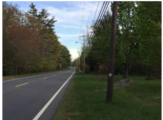
Potential location of sidewalk extension along Route 9.