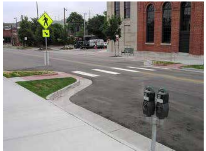
Curb extensions are often associated with mid-block crossings

A sidewalk extension into the street (into the parking lane) shortens crossing distance, increases visibility for walkers and encourages eye contact between drivers and walkers.