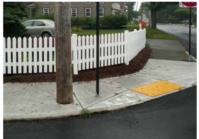
Curb ramp and detectable warning strip

Curb ramps provide access from the sidewalk to the street for people using wheel chairs and strollers. They are most commonly found at intersections. While curb ramps have improved access for wheelchair-bound people, they are problematic for visually impaired people who use the curb as an indication of the side of the street. Detectable warning strips, a distinctive surface pattern of domes detectable by cane or underfoot, are now used to alert people with vision impairments of their approach to streets and hazardous drop-offs.