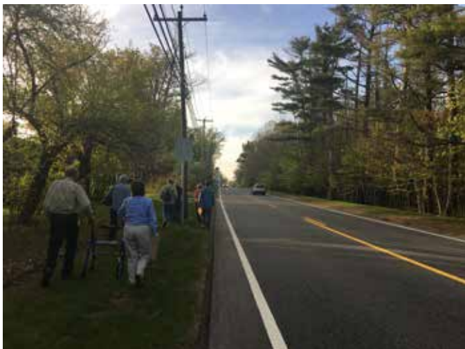
Walk audit participants walk on the grass along Route 9 near the Goshen Historical Museum.