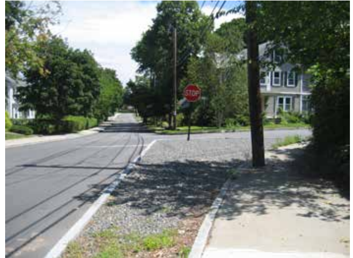
(A) Gravel-filled curb extension