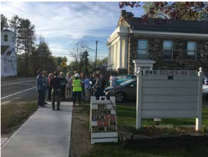
Concentration of town services at the intersection of East Street and Route 9