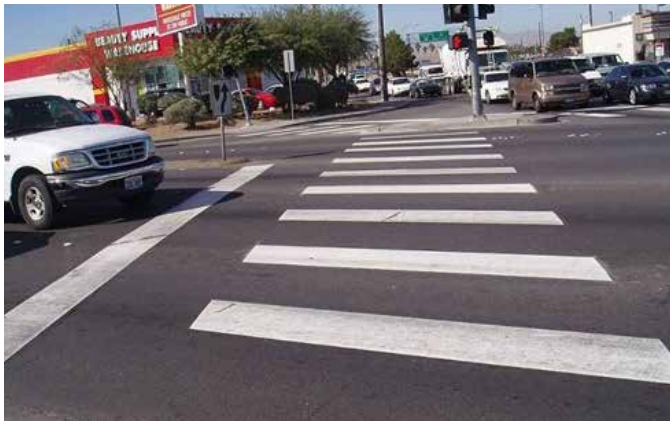
Crosswalk and stop line