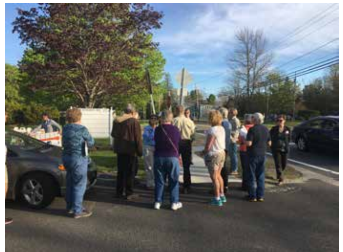
The walk audit began with a discussion of the Route 9 crossing.