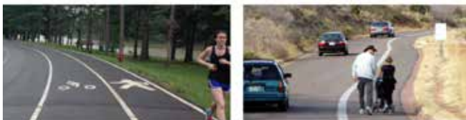
Pedestrian lanes as described in the Urban, Rural and Suburban Complete Streets Design Manual for the City of Northampton and Communities in Hampshire County - January 2017