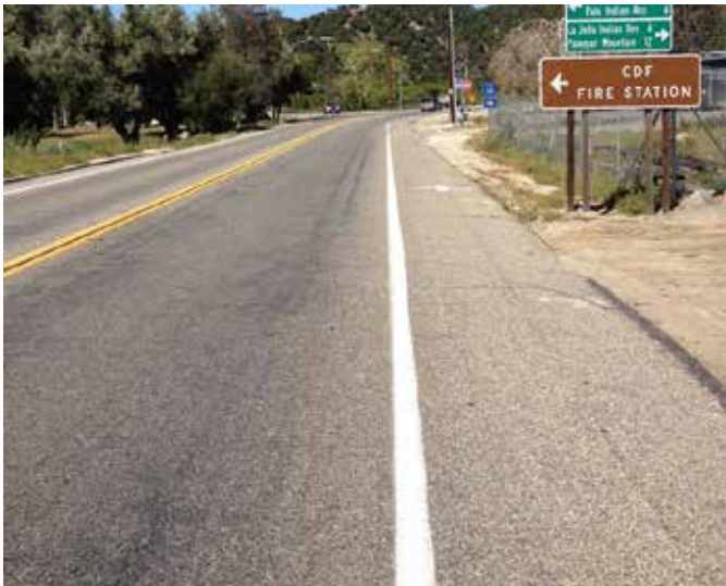
Fog lines delineate the vehicular driving zone on wide roadways.

A fog line is a solid white line painted along the roadside curb that defines the travel lane. It narrows a driver's perspective and helps to slow traffic speeds. Fog lines are used in urban, suburban and rural locations.