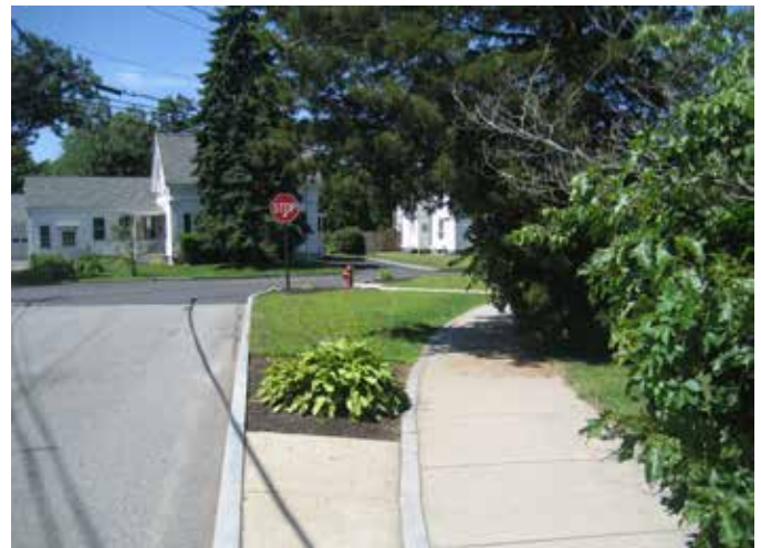
(B) Grass, trees and extended sidewalk in curb extension