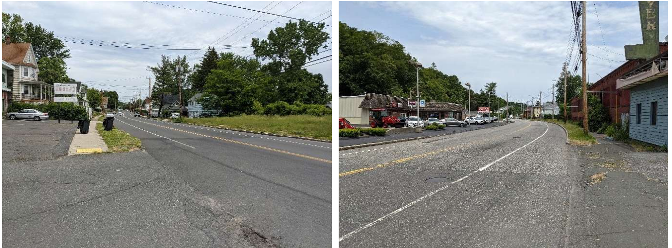
Existing Photos of Corridor

are most useful and to minimize the distance between crossings throughout the corridor, while also encouraging slower vehicle speeds.