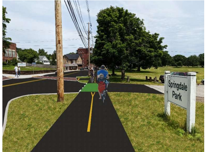
Renderings of Proposed Corridor