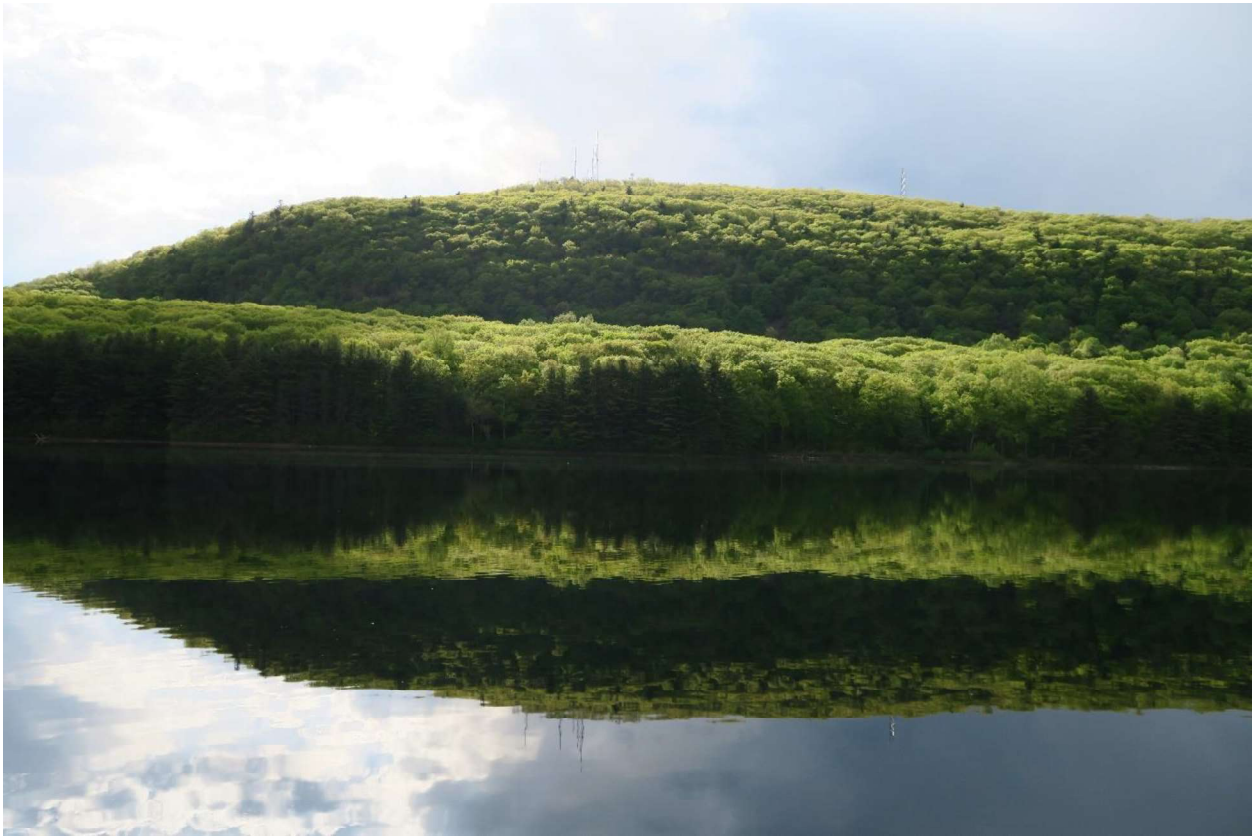
Plate 3. View of Whiting Street Reservoir and Mount Tom from the reservoir gatehouse