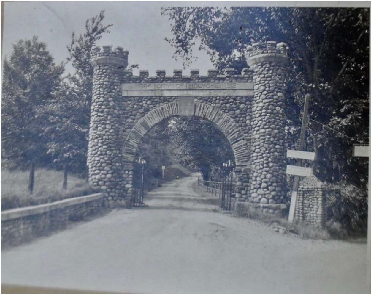
Cover Photo: Original Entrance to Whiting Street Reservoir