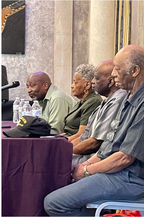
Panelists and Moderator for the "I was a Black G.I" discussion panel