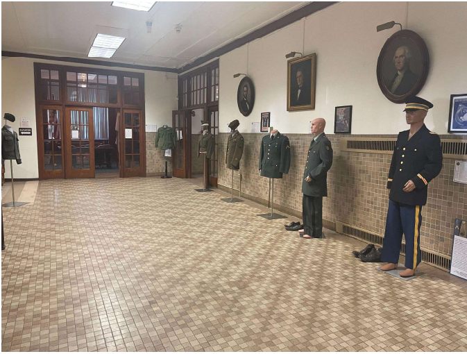
EXHIBIT ON DISPLAY AT HOLYOKE VETERANS SERVICES AT THE WAR MEMORIAL BUILDING