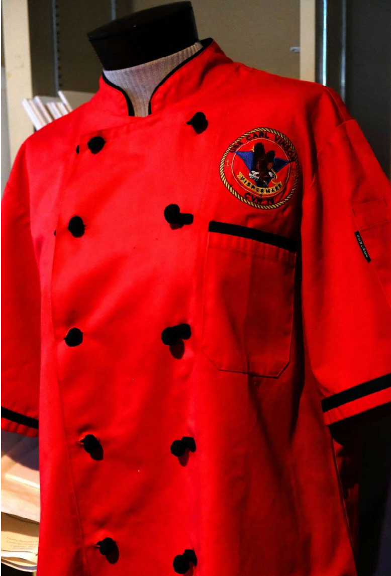
A local veteran loaned their culinary specialist uniform worn while serving on the USS Carl Vinson.