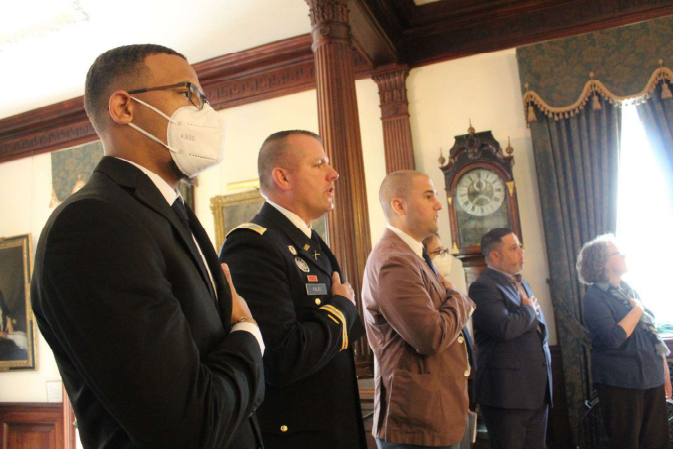
EXHIBIT OPENING PHOTOGRAPHS