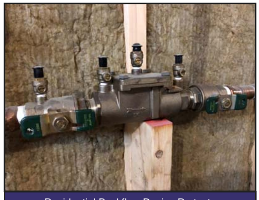
Residential Backflow Device Protects Drinking Water Supply

A cross connection is an actual or potential connection between a drinking water distribution system pipe and any waste pipe, soil pipe, sewer, drain, or other non-potable sources. The purpose of the program is to protect the public water supply from possible contamination by non-potable sources which could backflow into the water system via a cross connection.