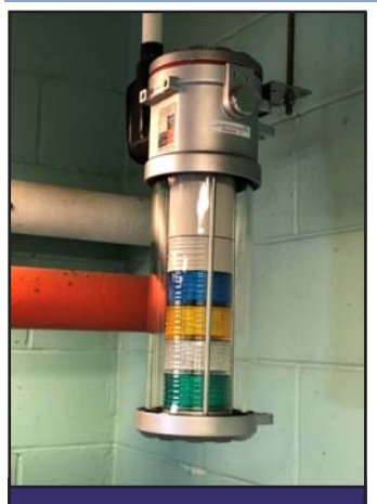
New Multi-Color Alarm Strobes

Holyoke's drinking water comes primarily from the Tighe-Carmody Reservoir in Southampton via a 6.6 mile Pre-stressed Concrete Cylinder Pipe (PCCP) constructed in 1997. The water supply is augmented by the McLean Reservoir in Holyoke by means of a transfer pump station located in the watershed of the Ashley Reservoir. The "blending" of these two water sources helps ensure the highest quality of water available throughout the year. Holyoke's water is treated at the Water Treatment Facility located at 600 Westfield Road adjacent to the McLean Reservoir. In 2017, HWW continued its efforts to blend water to reduce the formation of trihalomethanes (THMs) and halocetic acids (HAAs), which are regulated under the Disinfection Byproduct Rule. To meet this objective, HWW blended 80,669,000 gallons of water or 4.93% from the McLean Reservoir to meet the City's annual water supply needs of 1,635,415,000 gallons. We these steps in place, Holyoke has been able to maintain an