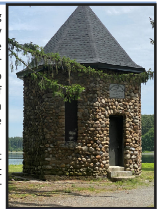
Ashley Reservoir Gate House