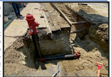
Upgraded Fire Protection in Lower Wards

In 2020, HWW contracted with Geeleher Enterprises for the Phase I Water Main Replacement Project and Ludlow Construction Co. for the MassWorks Water Main Replacement Project totaling an estimated $2,394,230.00. In addition, HWW authorized the replacement of an existing 6" water main in Chestnut Street with new 8" main through a change order with Geeleher Enterprises for the estimated amount of $180,000.00. These improvements were authorized by the Holyoke City Council under a $13.39 million and $6.54 million bond authorization for the System-Wide Capital Improvement Projects to address deficiencies identified in the municipal water system. The Phase I and MassWorks Water Main Replacement Projects are designed to significantly improve fire protection, system reliability as well as water quality to the lower Wards and Chestnut Street areas.