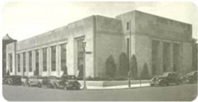
WAR MEMORIAL BUILDING 310 APPLETON STREET HOLYOKE, MA 01040