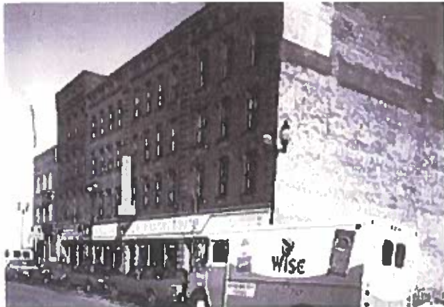
Wright Block - former Wernick furniture HLY.179