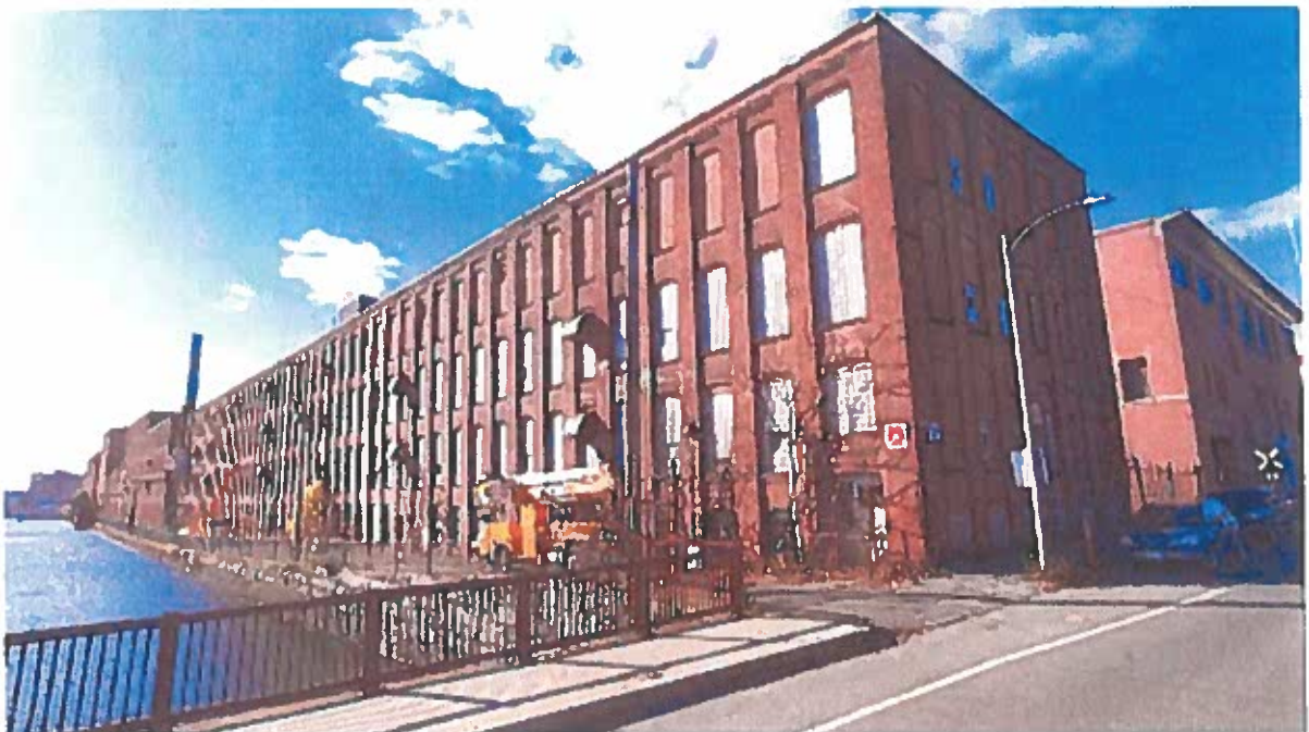
Farr Alpaca Mill project HLY.AH. (industrial complex)