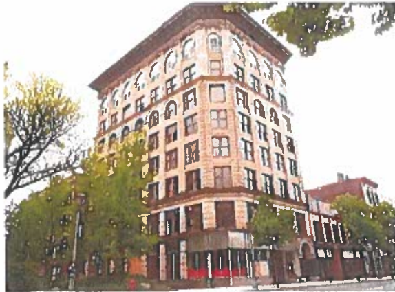
276 High St. - HLY.195