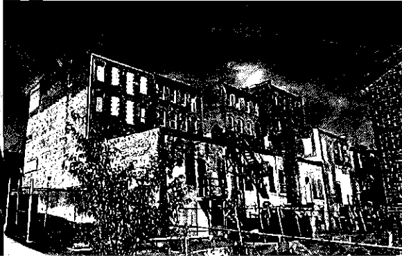
rear 106 Wright

CPA proposal- tabled for August meeting.