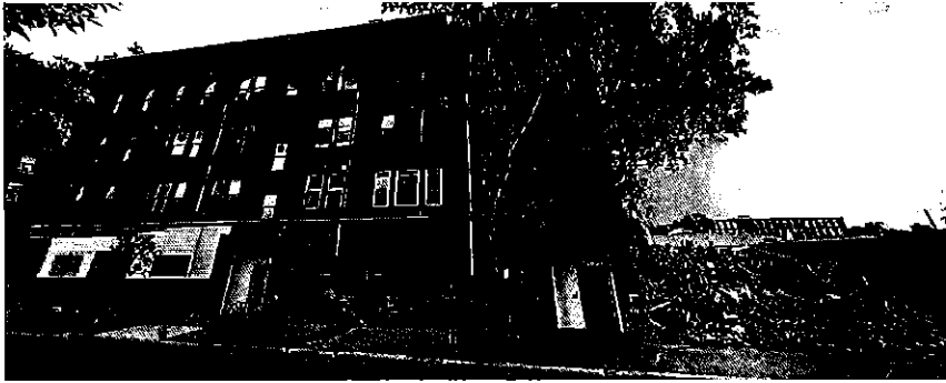
27-29 Cabot St.