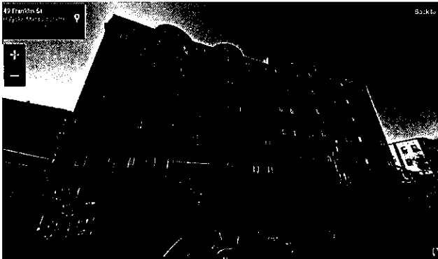
48-52 Franklin/348 Chestnut