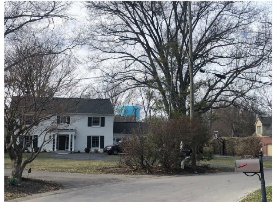
PROPOSED WATER TOWER