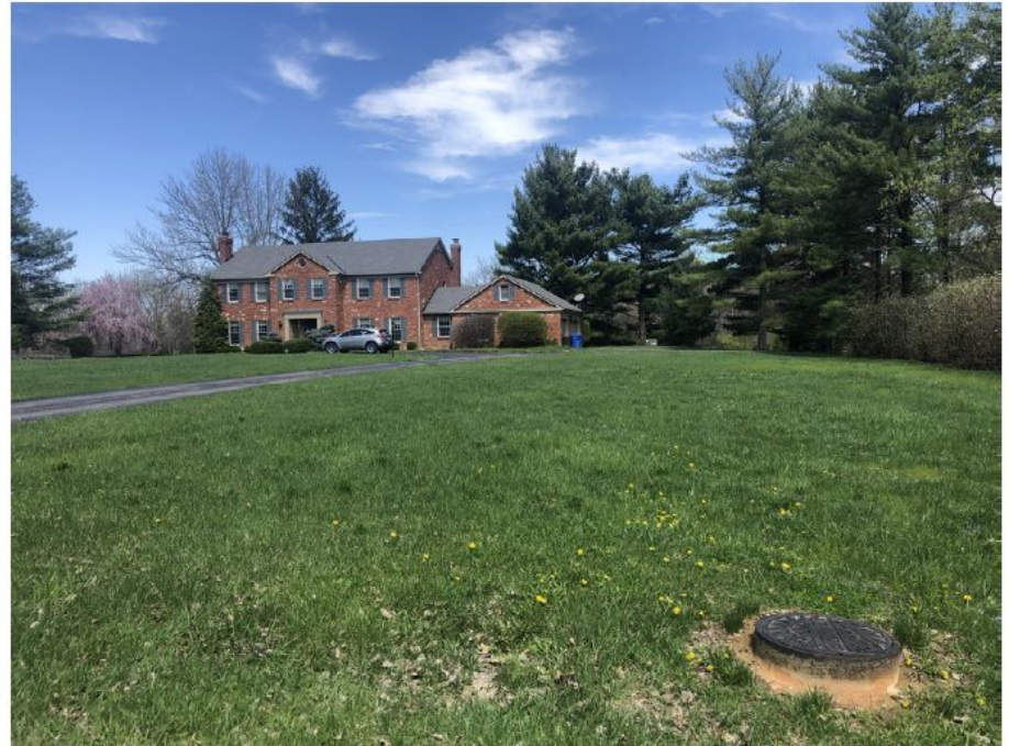
PROPOSED WATER TOWER