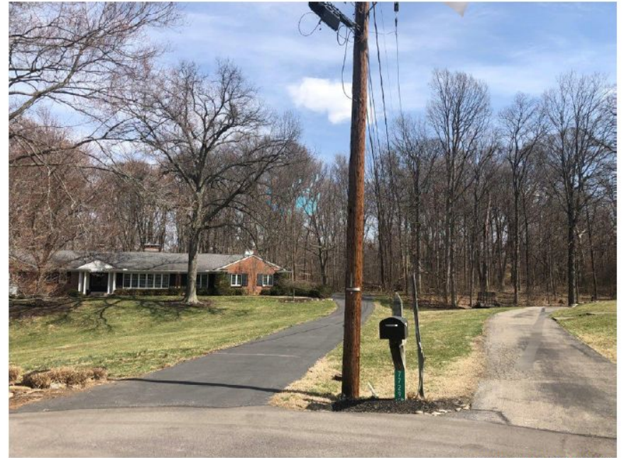
PROPOSED WATER TOWER