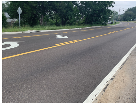
The City of Jackson and the One Percent Sales Tax Commission OK’d repaving efforts across the city.

Mayor Lumumba, the One Percent Sales Tax Commission, and the City Council recently approved funding for a wide range of street repaving and improvement projects in neighborhoods across the city.