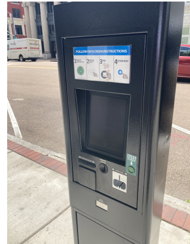
New state-of-the-art parking kiosks have been installed in areas of downtown Jackson.

In addition to educating the public on how to use the kiosks, SP+ will also assist the city with enforcement by providing vehicles with License Plate Recognition technology to maximize parking availability.