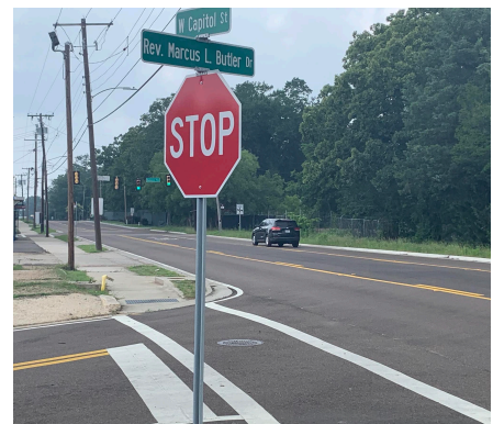
Plans are underway to repave roughly 80 roads in Jackson neighborhoods.

In total, officials agreed to the repaving of roughly 80 roads over a 40-mile stretch across all wards of the city. The project is broken into three phases and expected to be completed by the end of 2024.