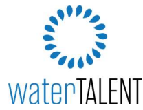
EXHIBIT A FEE SCHEDULE