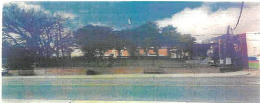
Proposed site of Fondren's Performance Park (West side of Old Canton Road)

Phase 1 Design, Stage Construction, Management Agreement, Programming (see concepts on the following page.)