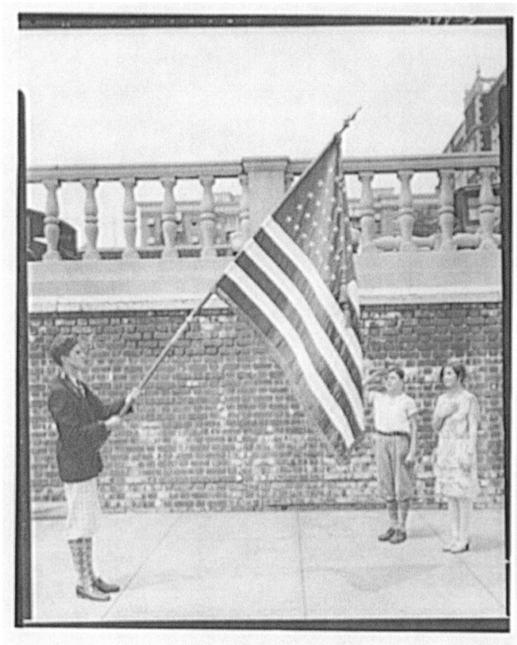
Central High School. School children at Central High III. [Prince George's County, Maryland].