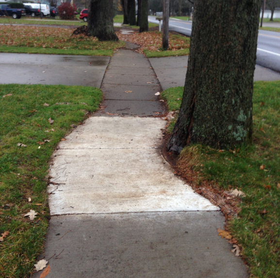
~300 spot repairs of concrete, sidewalk slabs