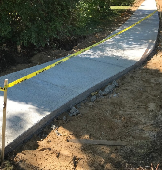
2.8 miles of new sidewalks, off busy streets