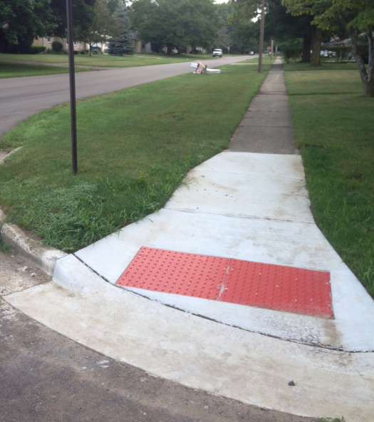
195 ADA sidewalk ramps