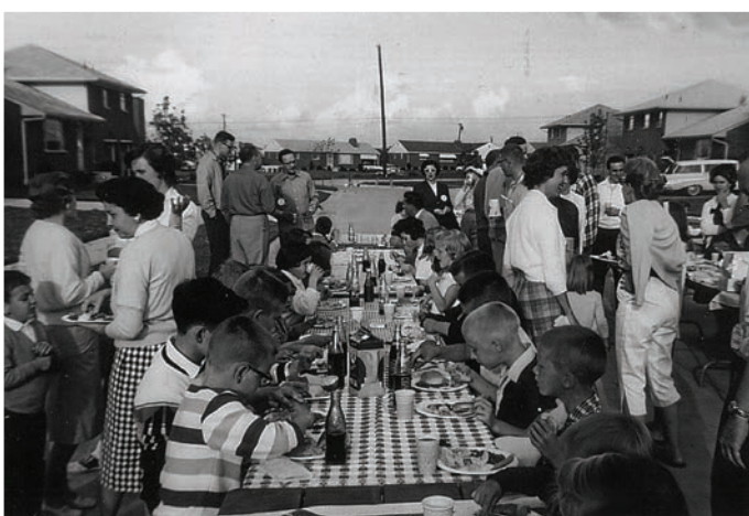
Kettering neighborhood block party May, 1960