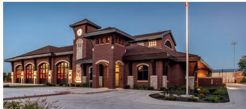
Station 32, located at 3484 Far Hills Avenue.