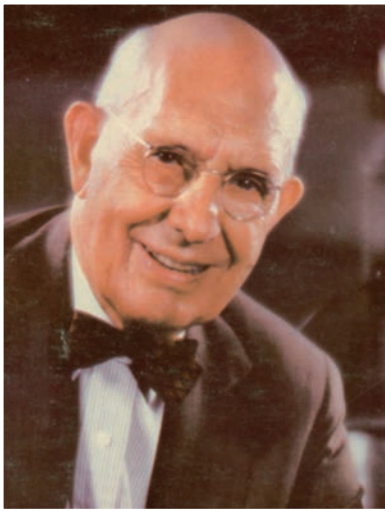
Charles F. Kettering