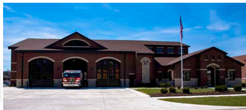
Station 37 at 1300 West Dorothy Lane