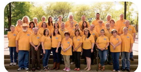
2017 Holiday at Home volunteer committee

to thank the Holiday at Home volunteers for their hard work and dedication to an event that our entire community is proud to call our most treasured annual tradition. For more information, please visit www.holidayathome.org .