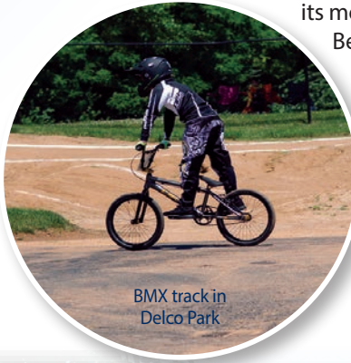
BMX track in Delco Park

In Kettering, we are focused on providing parks, recreation and cultural art spaces, places and programs that make Kettering a premiere community to call home.