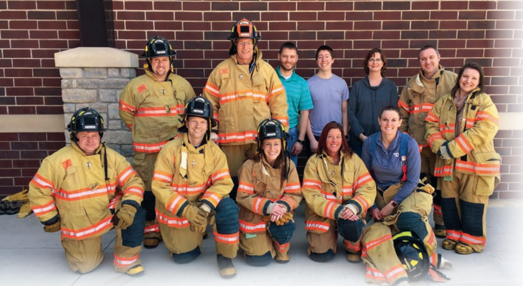
2017 Leadership Academy Class learns what it takes to be a first responder.

and become a resource for leadership opportunities in Kettering.