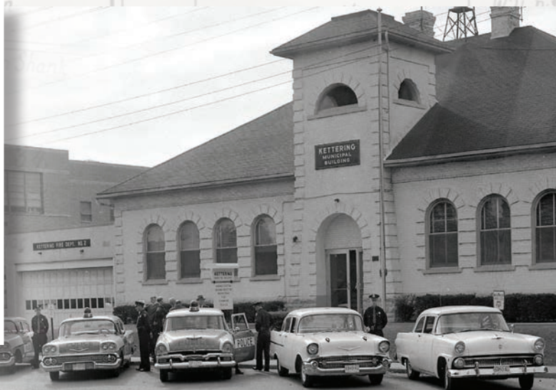
1960 Police Car inspection at Original Municipal Building