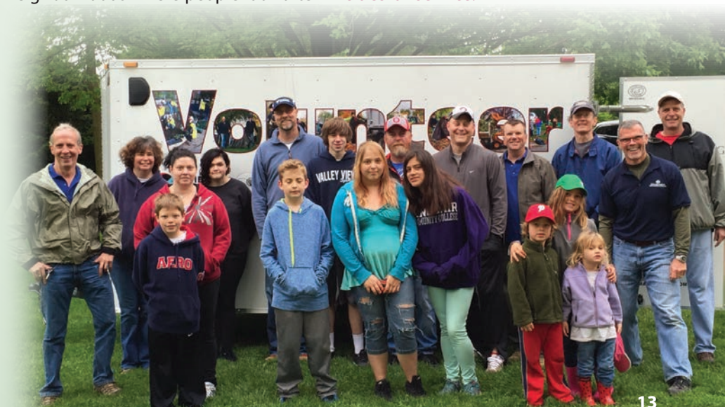
Volunteers and Kettering staff at a neighborhood cleanup event.