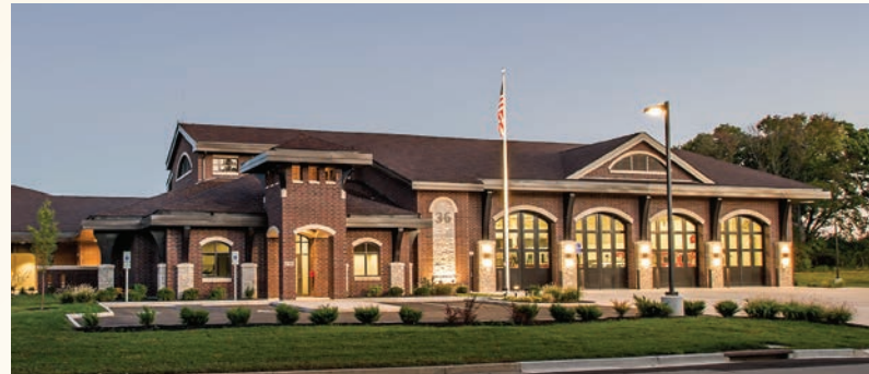
Station 36, Fire Headquarters and Emergency Operations Center at 4745 Hempstead Station Drive.

For Emergencies: dial 9-1-1 Non-emergencies: 937-296-2555