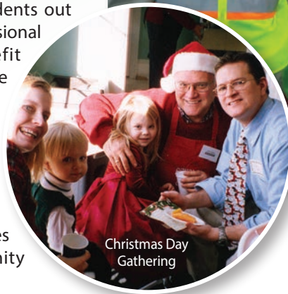
Christmas Day Gathering