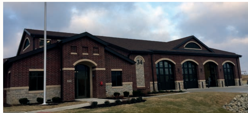
Station 34 at 2575 Woodman Drive directly south of Tenneco.