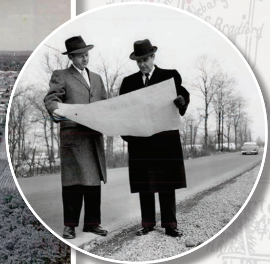
City officials planning new streets and developments circa 1955