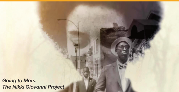
Going to Mars: The Nikki Giovanni Project

Community Art Project Presentations Film Screening