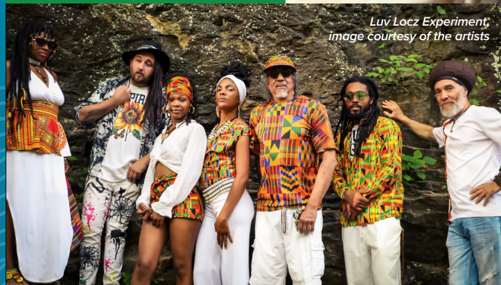
Luv Locz Experiment