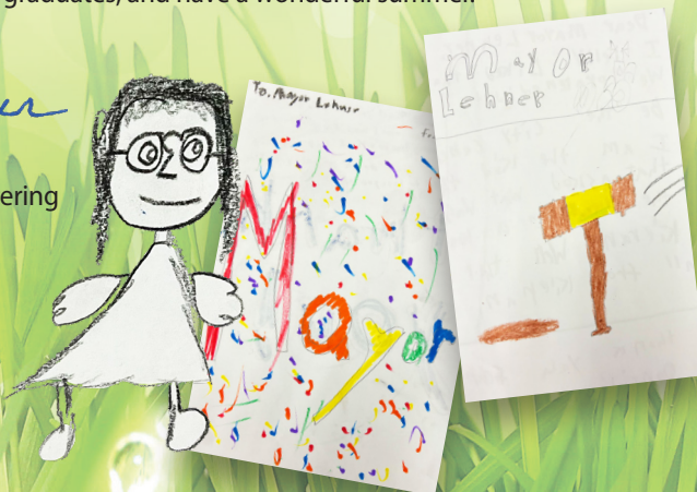
Peggy Lehner, Mayor of Kettering