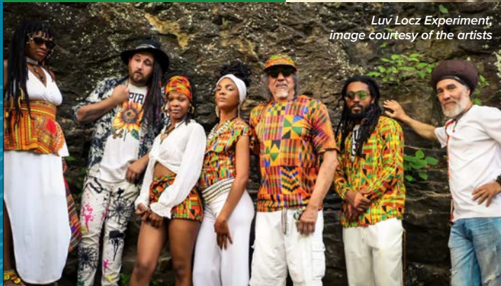
Luv Locz Experiment, image courtesy of the artists