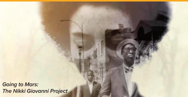
Going to Mars: The Nikki Giovanni Project

Community Art Project Presentations Film Screening