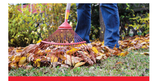
YARD WASTE Yard waste should be placed in your trash cart and can be commingled with your trash.