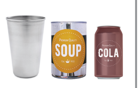
Non-hazardous, non-flammable material only.