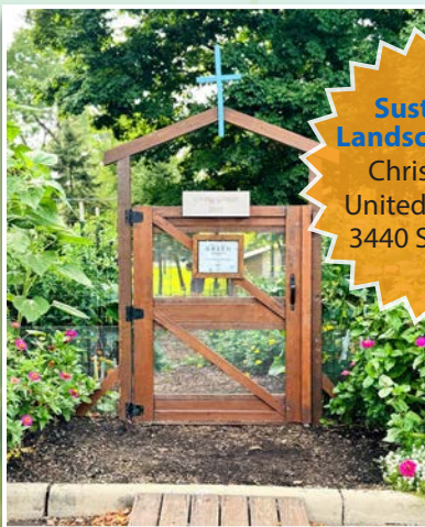
Sustainable Landscape Award Christ Church United Methodist 3440 Shroyer Rd.