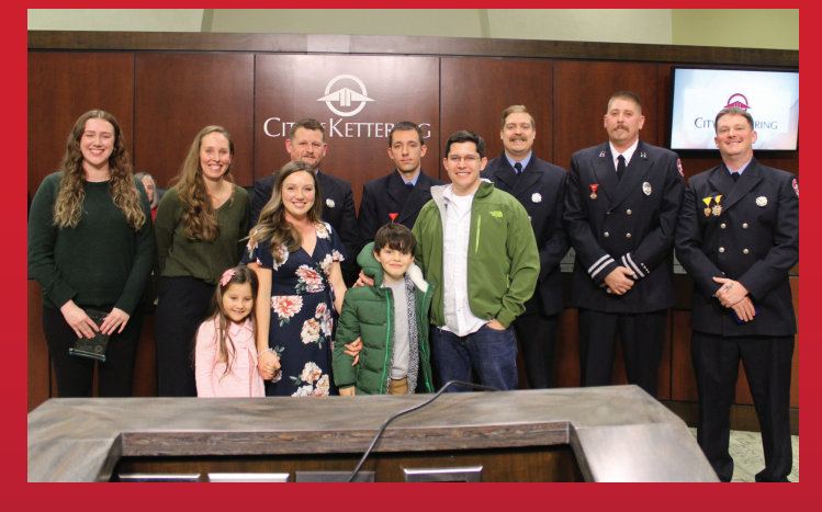
We're proud to report that the patient made a full recovery. Upon delivering a heartfelt speech at the Council Meeting, there was not a dry eye in the room. This is Kettering—where community means everything.