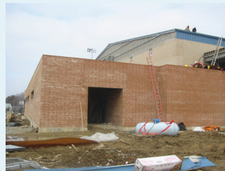
KFWC during construction

Join us Nov. 3 – 9 and be part of this incredible milestone. Here's to the next 20 years of health, wellness and community spirit at KFWC!