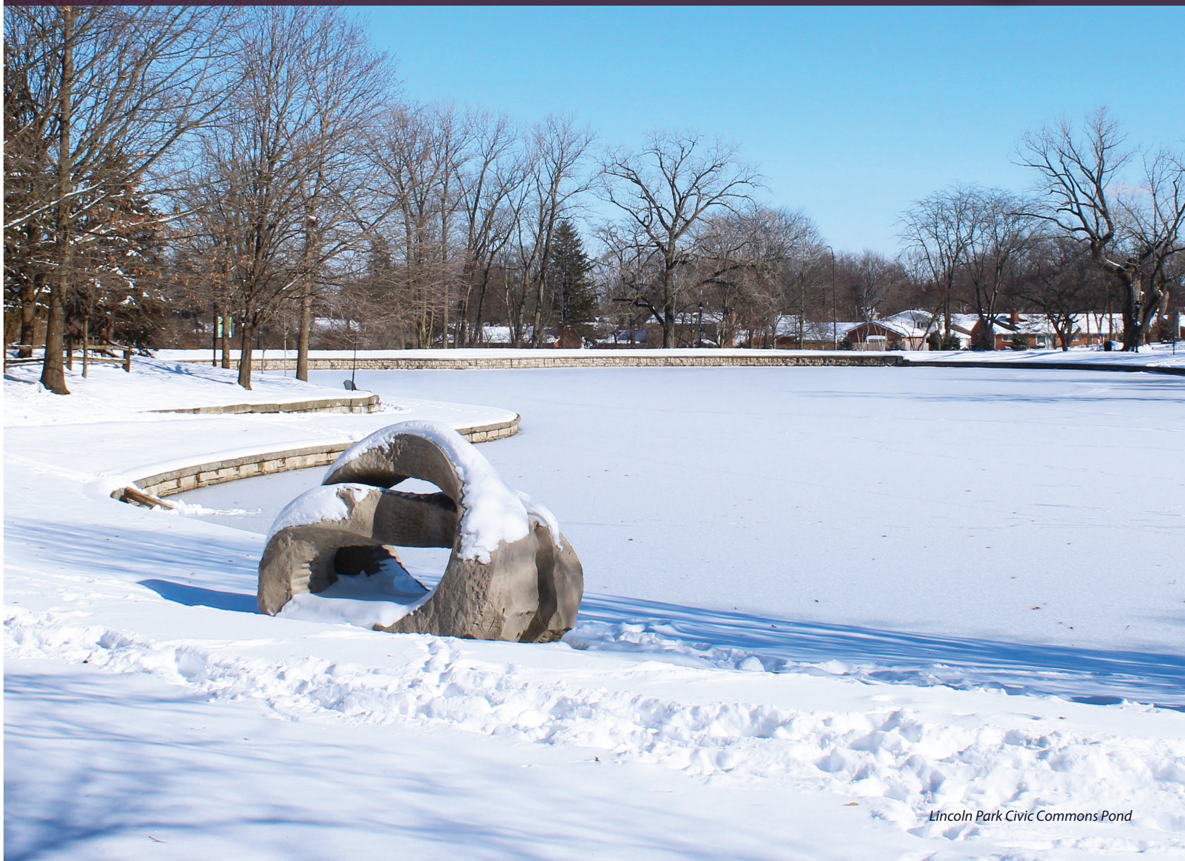
Lincoln Park Civic Commons Pond