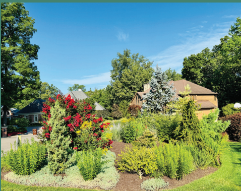
555 Timberlea Trail

This is the third year presenting the Sustainable Landscape Award. This award is presented to a home or business owner who has incorporated sustainable practices into their landscaping. Possible projects include reduction of water usage through reclamation or incorporation of drought tolerant plant species, installation of energy efficient exterior lighting, use of sustainable materials such as recycled composite, runoff reduction through rain gardens or permeable surfaces or the addition of multiple native plants in landscaping. The winning property must comply with city ordinances and is reviewed using the Neighborhood Pride Scoring parameters.