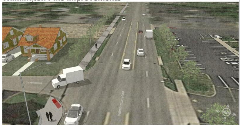
Looking north from Cloverfield Ave

Reinvestment toward improvements in our infrastructure remains an area of emphasis for Kettering City Council. The 2017 Kettering capital improvement fund budget is $17.5 million, $2.2 million of which is covered through outside funding. The City of Kettering Engineering Department will be very active in 2017 with construction projects throughout Kettering.