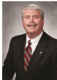
Don Patterson, Mayor City of Kettering, Ohio