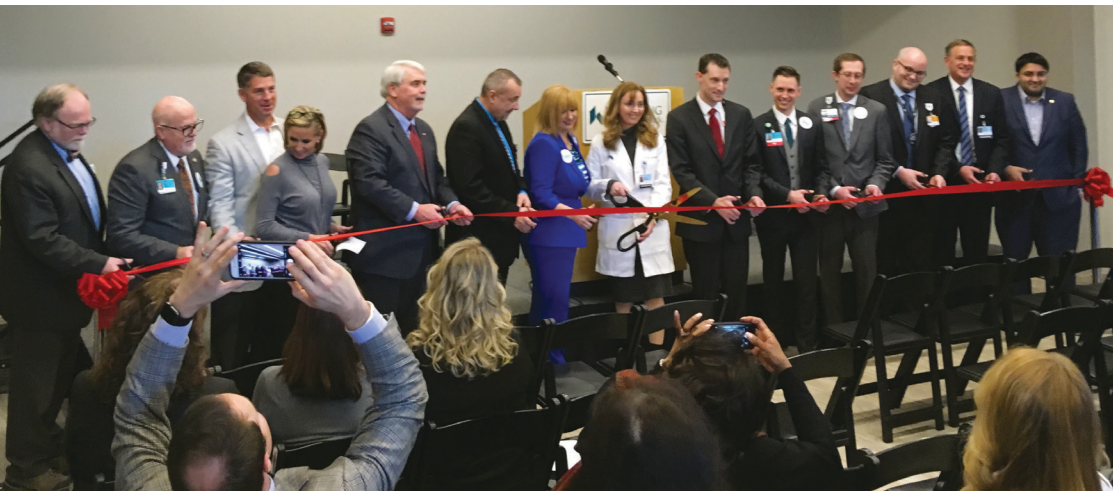
Kettering Health Network's new command center ribbon cutting.

In 2017, the City worked with our tenant partners to develop a master plan for the Kettering Business Park campus. In 2018 we started to implement the first phases of that plan. We designed and installed modern entry signage and completed upgrades to landscaping and pathways near the entrance. The next year will bring completion of the second phase of the plan which will include landscaping in the round-about and installation of directional signage.