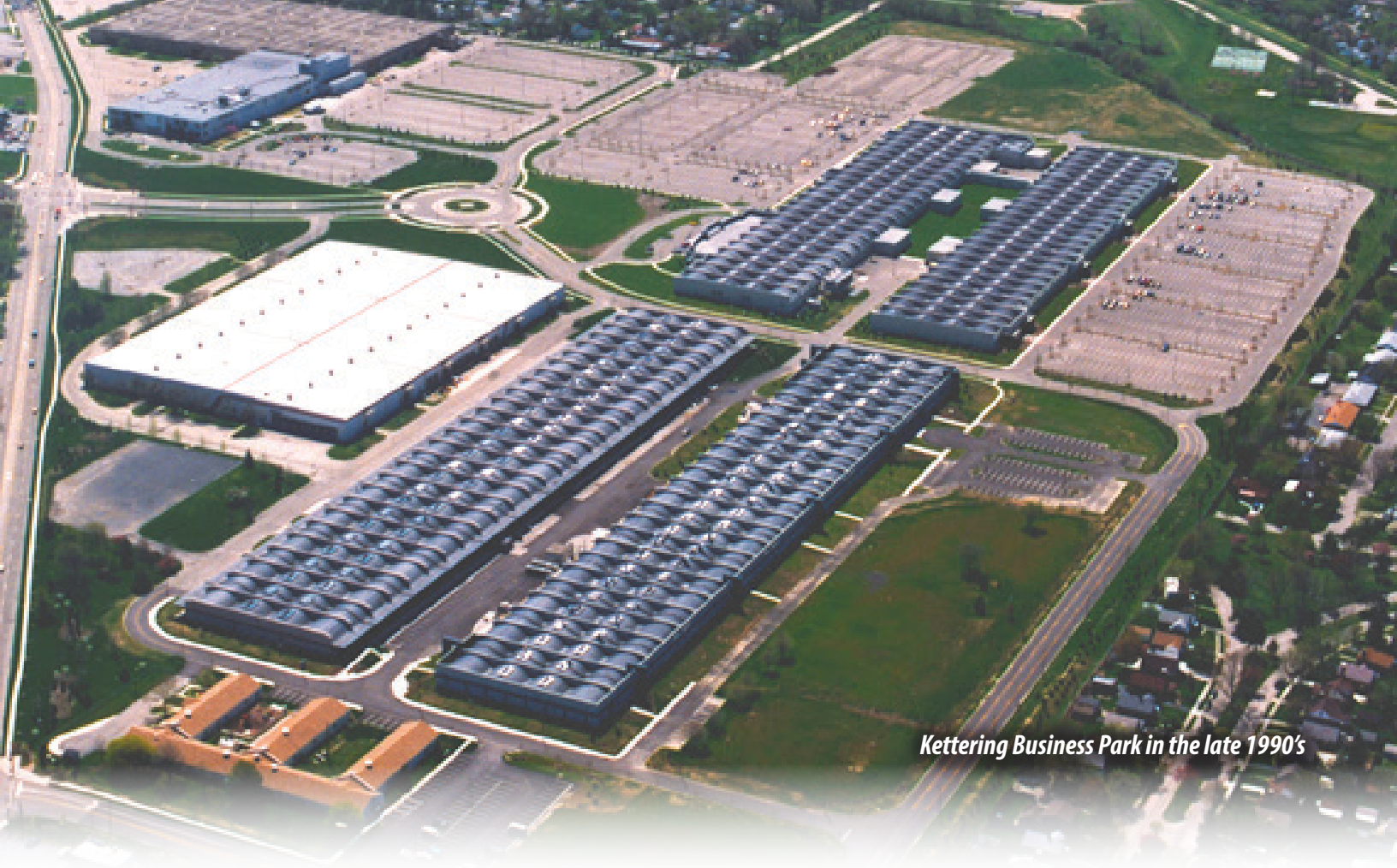
Kettering Business Park in the late 1990's