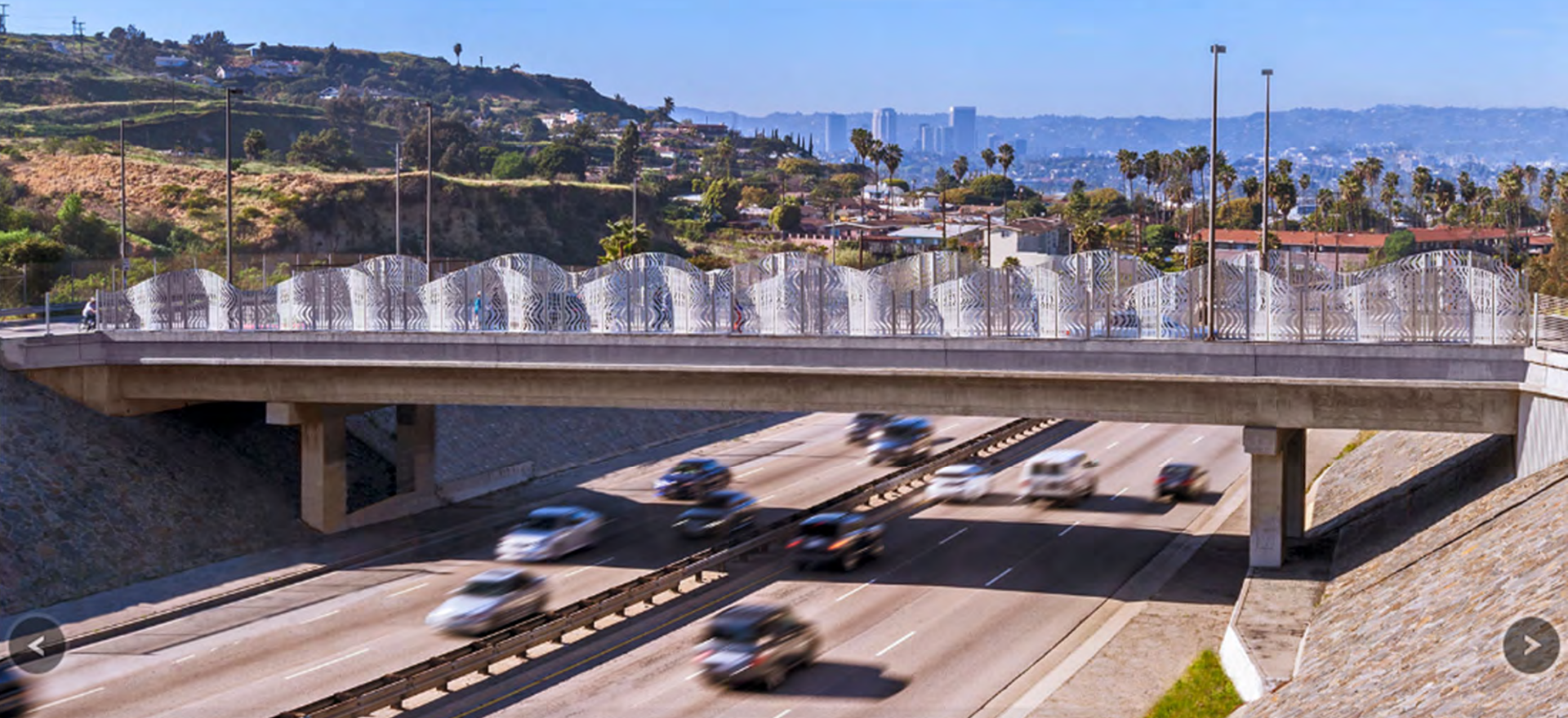
2012 / BALDWIN HILLS GATEWAY / Ken Hahn Bridge, Los Angeles, California