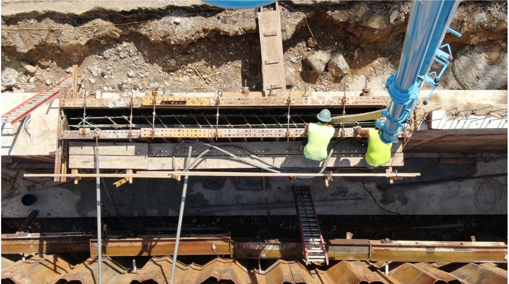
BIRDS EYE VIEW OF POURING CONCRETE FOR RETAINING WALL