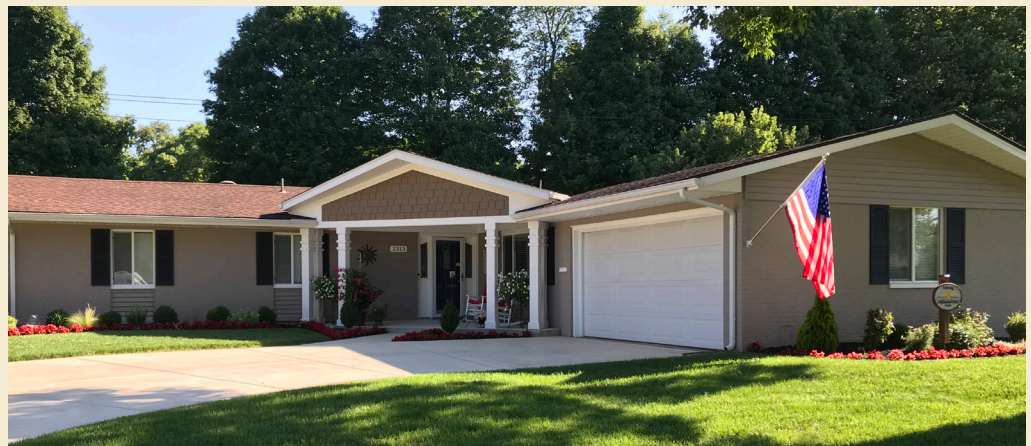
2020 Award winning property at 2313 Belloak Dr.