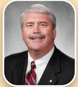
Mayor Donald E. Patterson