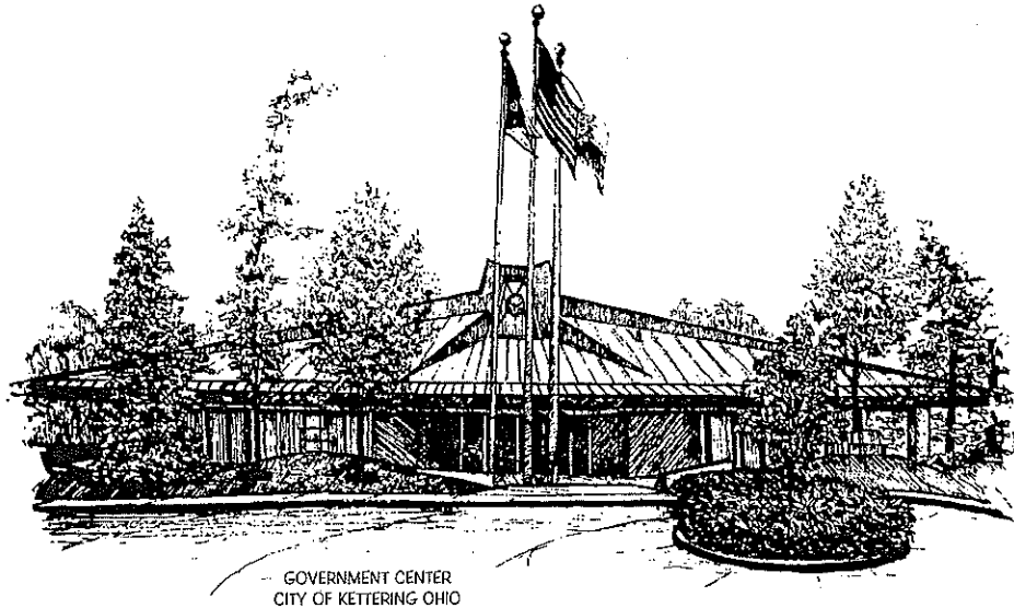
GOVERNMENT CENTER CITY OF KETTERING OHIO