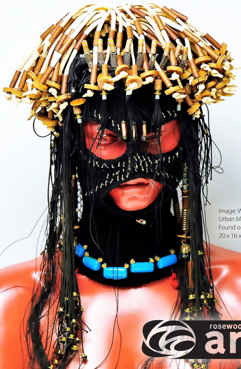
Image: Willis Bing Davis Urban Mask #17 , 2006 Found objects 20 x 16 x 10 inches