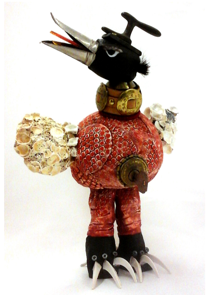
Sarah Hydell The Making of a Predator , 2019 Ceramic and found materials 13-1/4 x 9-1/2 x 10-1/2 inches NFS