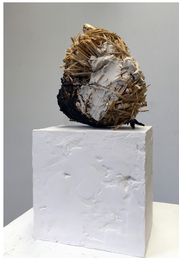
Emily Trick Untitled , 2010 Straw, clay, paint and string on cast plaster base 13 x 7 x 5 inches NFS