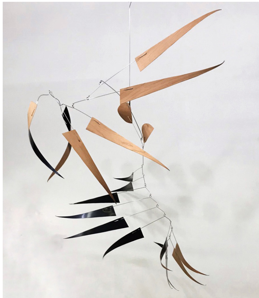
Terry Welker Black Flow , 2020 Cherry veneer, black anodized aluminum, copper, stainless steel 45 x 60 x 360 degree rotation $2,500