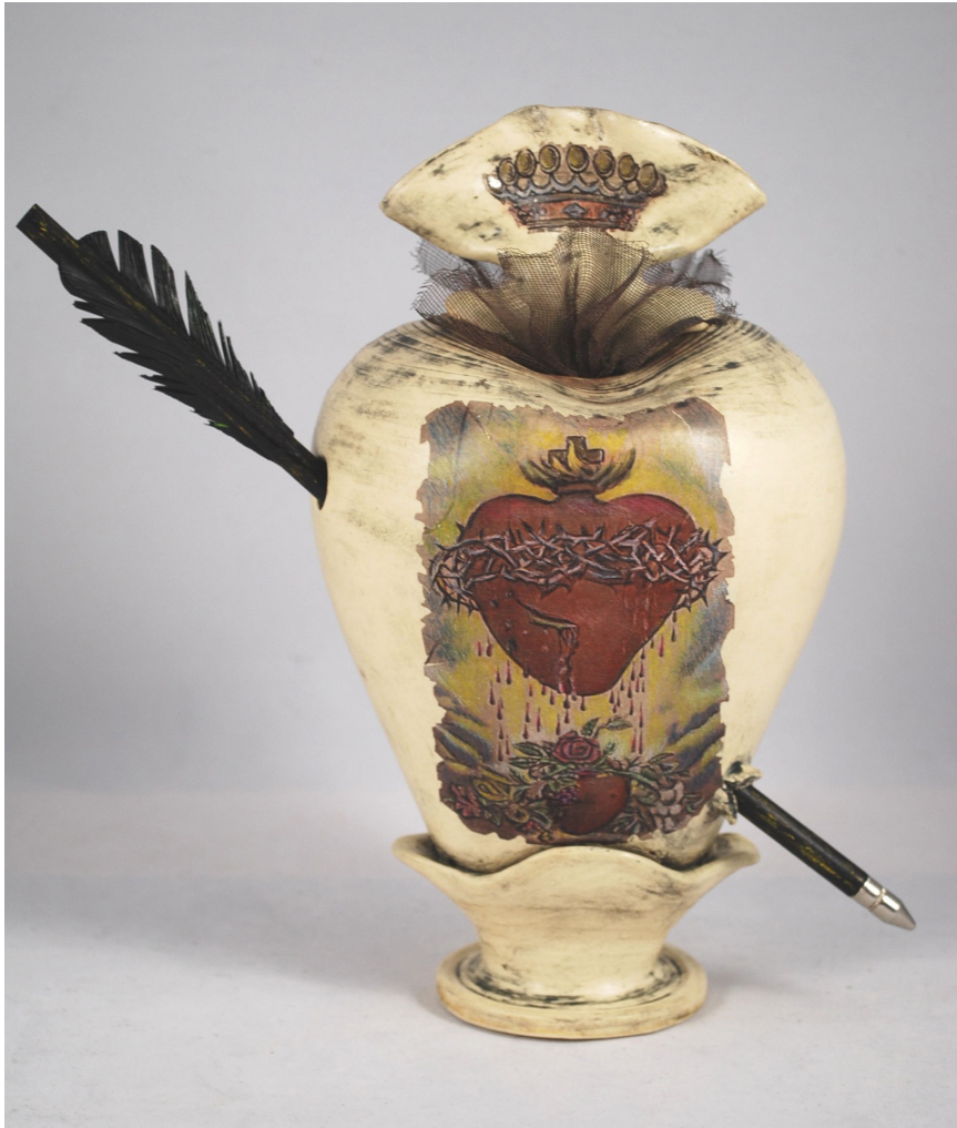
Cynthia Bornhorst Winslow Heartbreak & Hope , 2017 Wheel-thrown stoneware with hand-colored decal 10-1/2 x 10 x 5-3/4 inches $350