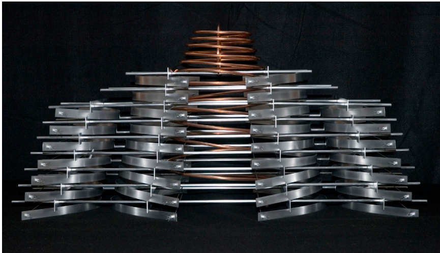
Connie R. Campbell Series III #5, 2019 Aluminum, steel cable, copper 18 x 18 x 37 inches $1,200