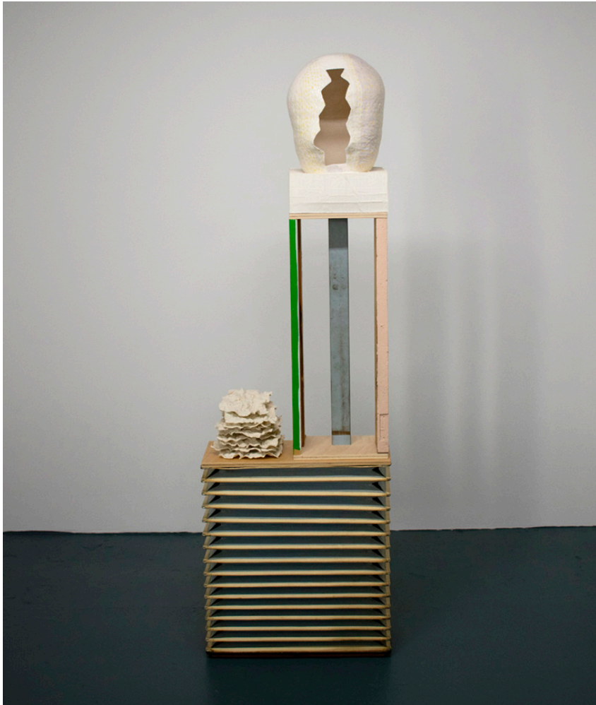
Ashley Jude Jonas See Through Thinking, 2020 Accordion bellow, found wood, purchased wood, porcelain, glaze and plaster 55 x 17 x 7 inches NFS