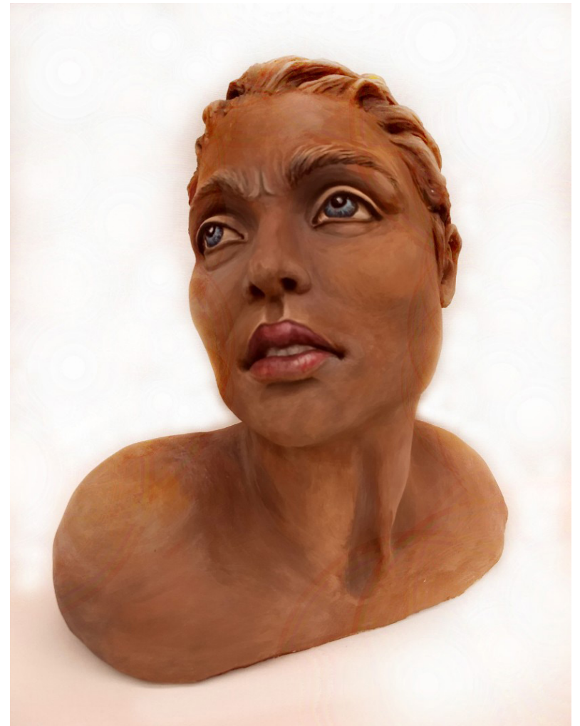
Patricia Boone Unrest , 2019 Ceramic 15 x 14 x 10 inches $350