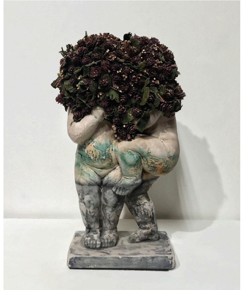
David Kenworthy Separated and Confined, 2019 Plaster, dye and foliage 14 x 7 x 5 inches NFS