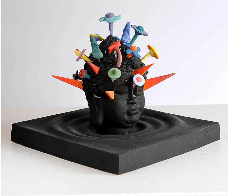
Doug Harlow Big Buddha Bang , 2020 Ceramic 9 x 9-1/2 x 10 inches NFS