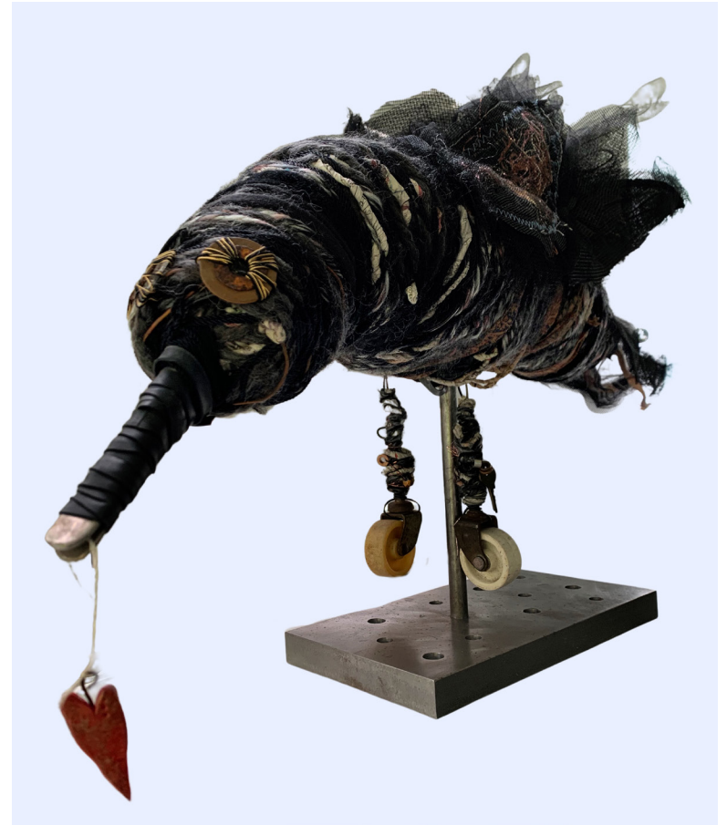
Glenda Miles Divine Fury, 2020 Plastic, assorted natural fibers, rubber bicycle inner tubes, recycled newspaper yarn, sari ribbon, nylon screen, tulle, reclaimed fabric scraps, beads, rusty washers, vintage castor wheels, silver spoons, assorted annealed and copper wire, fabricated metal base from local machine shop 28 x 5 x 32 inches NFS