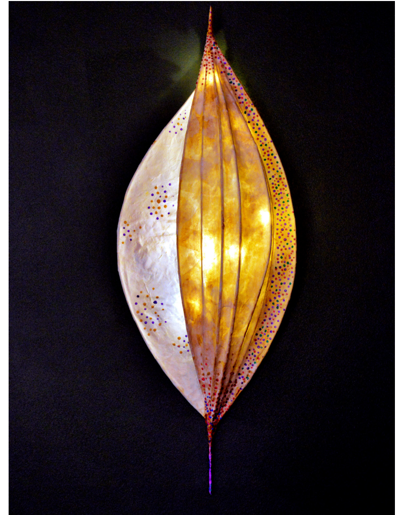
Deborah Dixon Illumination Series II, 2020 Wood, paper, glue, powder LED Battery/light and paint 11-1/2 x 31 x 5-1/2 inches $275