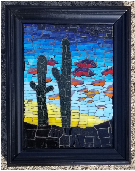
Jes McMillan You and Me, 2020 Glass mosaic 9-1/2 x 7-1/2 inches $260