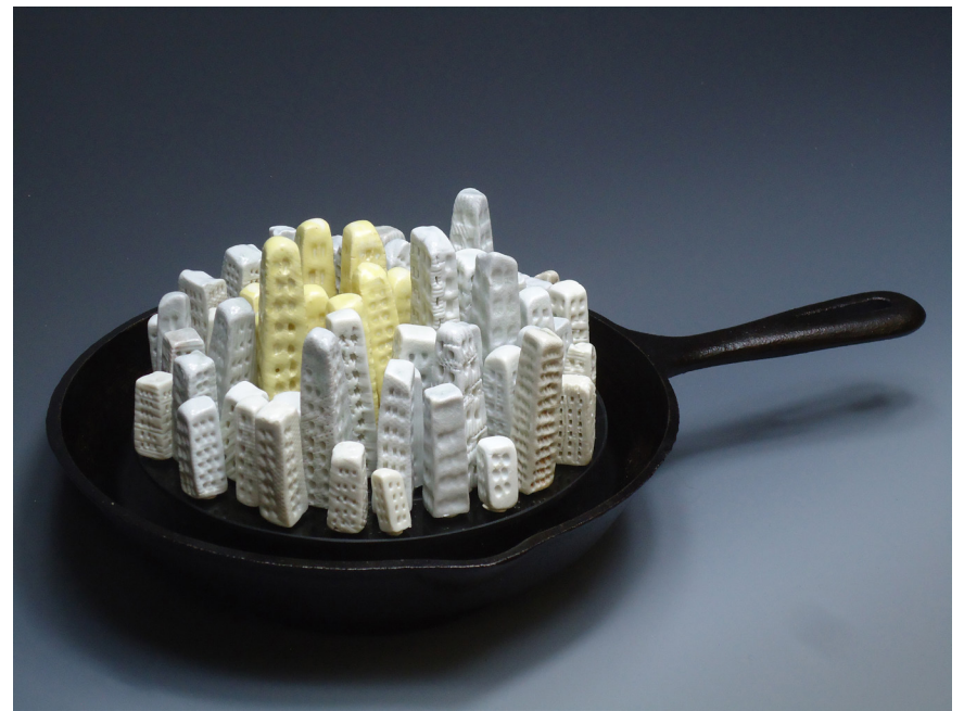
James Champion Cityscape Sunny Side Up, 2020 Ceramic, glass and found object 6 x 8 x 8 inches