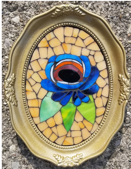
Jes McMillan Italian Brooch Flower Study, 2020 Glass mosaic 8-1/2 x 6-1/2 inches $228