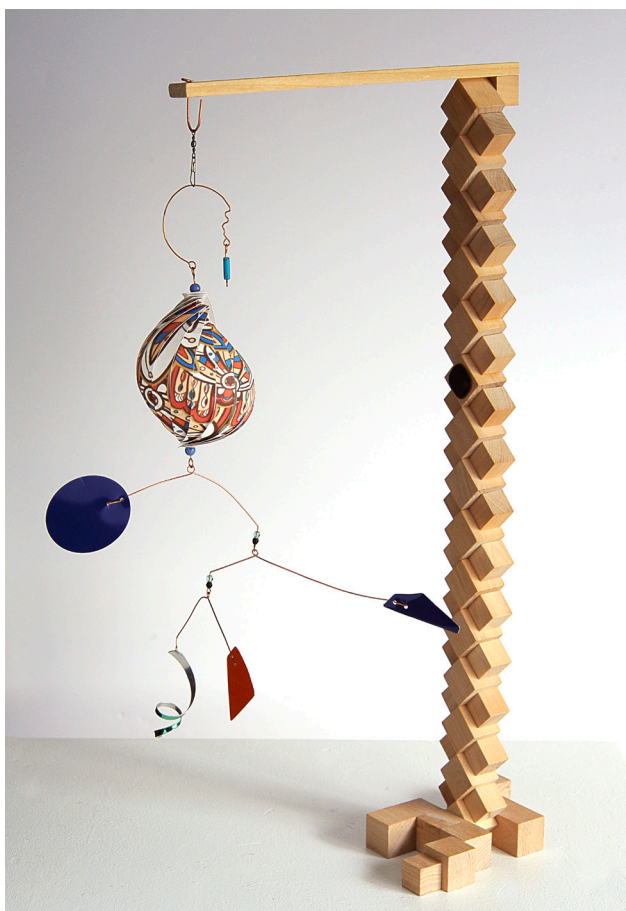
Pete Mitas Convergence , 2017 Wood, metal, paper, enamel, and beads 22 x 4 x 19 inches $150