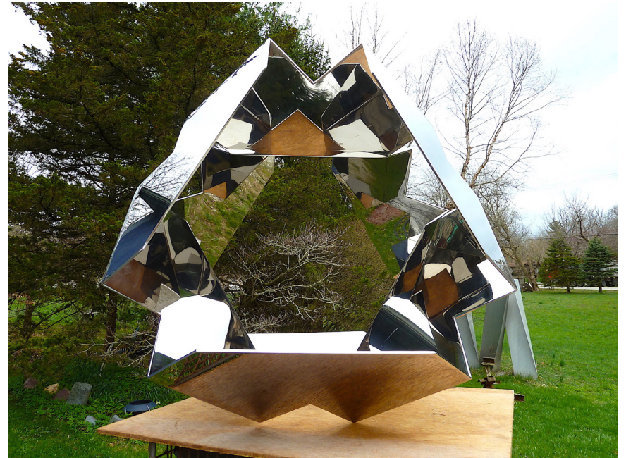
Jon Barlow Hudson As Above – So Below , 2018 Mirror stainless steel 14 x 17 x 17 inches $9,000