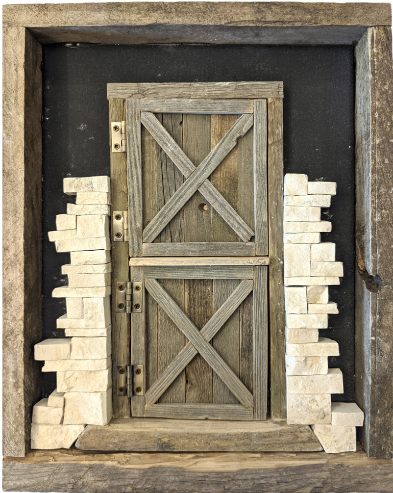
Ron Hundt A Great Bond , 2020 Cut rock, wood, metal on canvas 10 x 8 x 2 inches NFS