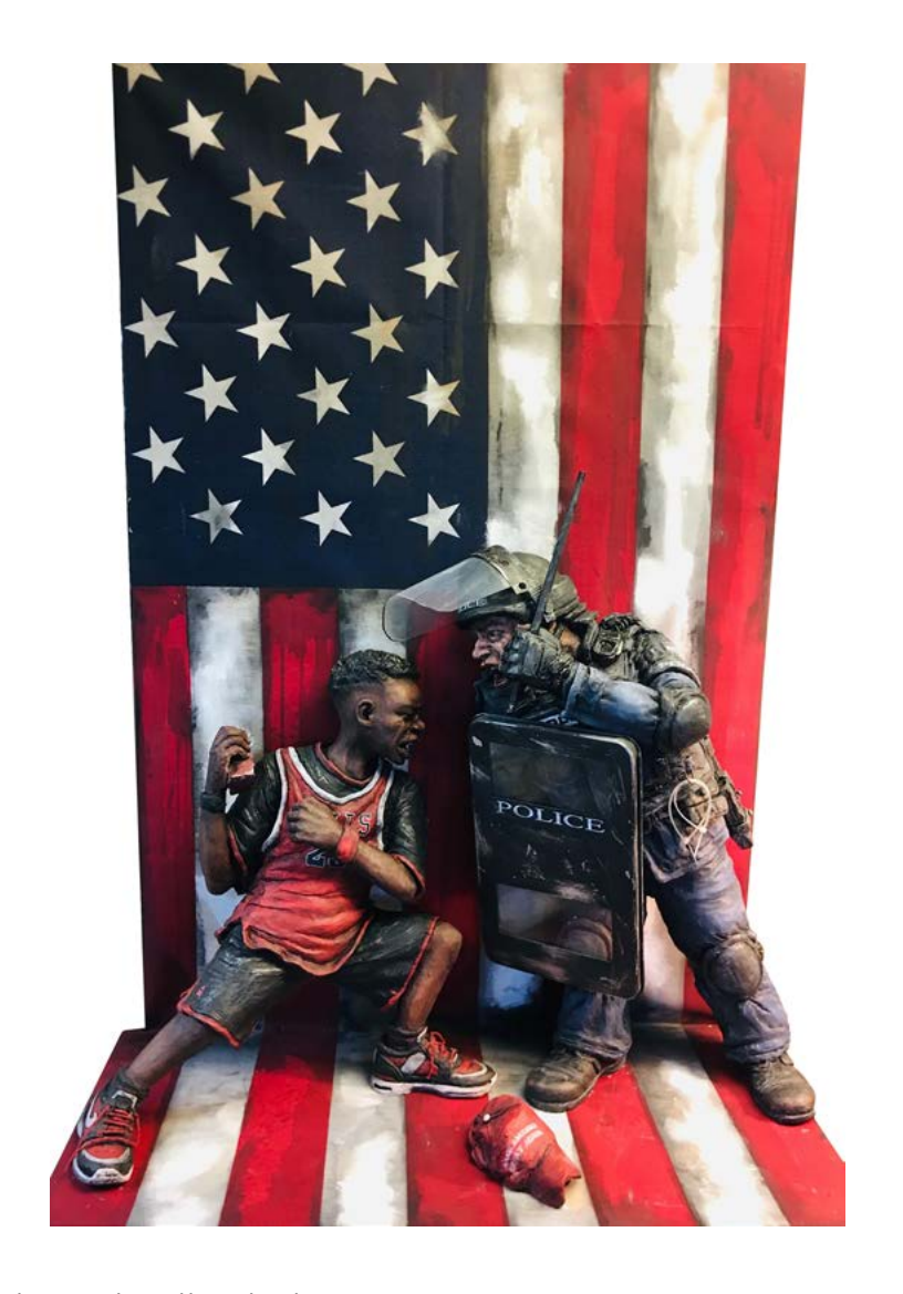
Kyle and Kelly Phelps David and Goliath, 2016 Standard 182 stoneware, wood frame, American flag, oil paint 36 x 22 x 11 inches