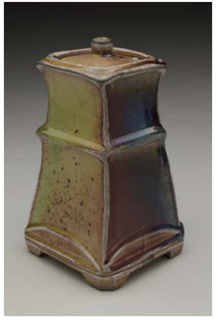
Vase, 2020 Wheel thrown and altered stoneware, soda fired 18 \times 9 \times 4 inches

Cut Jar, 2020 Wheel thrown and altered stoneware, soda fired 10 x 6 x 6 inches