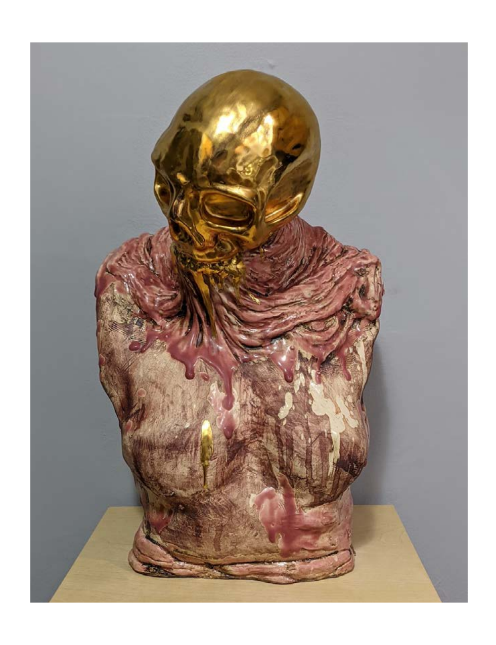
Brandon Lowery Council of Charlatans, 2021 Ceramic, glaze, oxide washes, luster, cone 6 firing and luster firing 18.5 x 12 x 9 inches