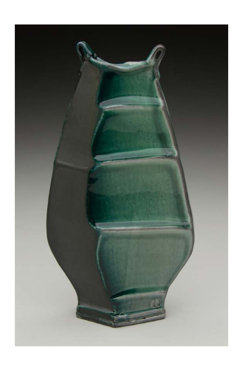
Brad Schwieger Cut Vase, 2020 Wheel thrown and altered stoneware, soda fired 16 x 8 x 3 inches