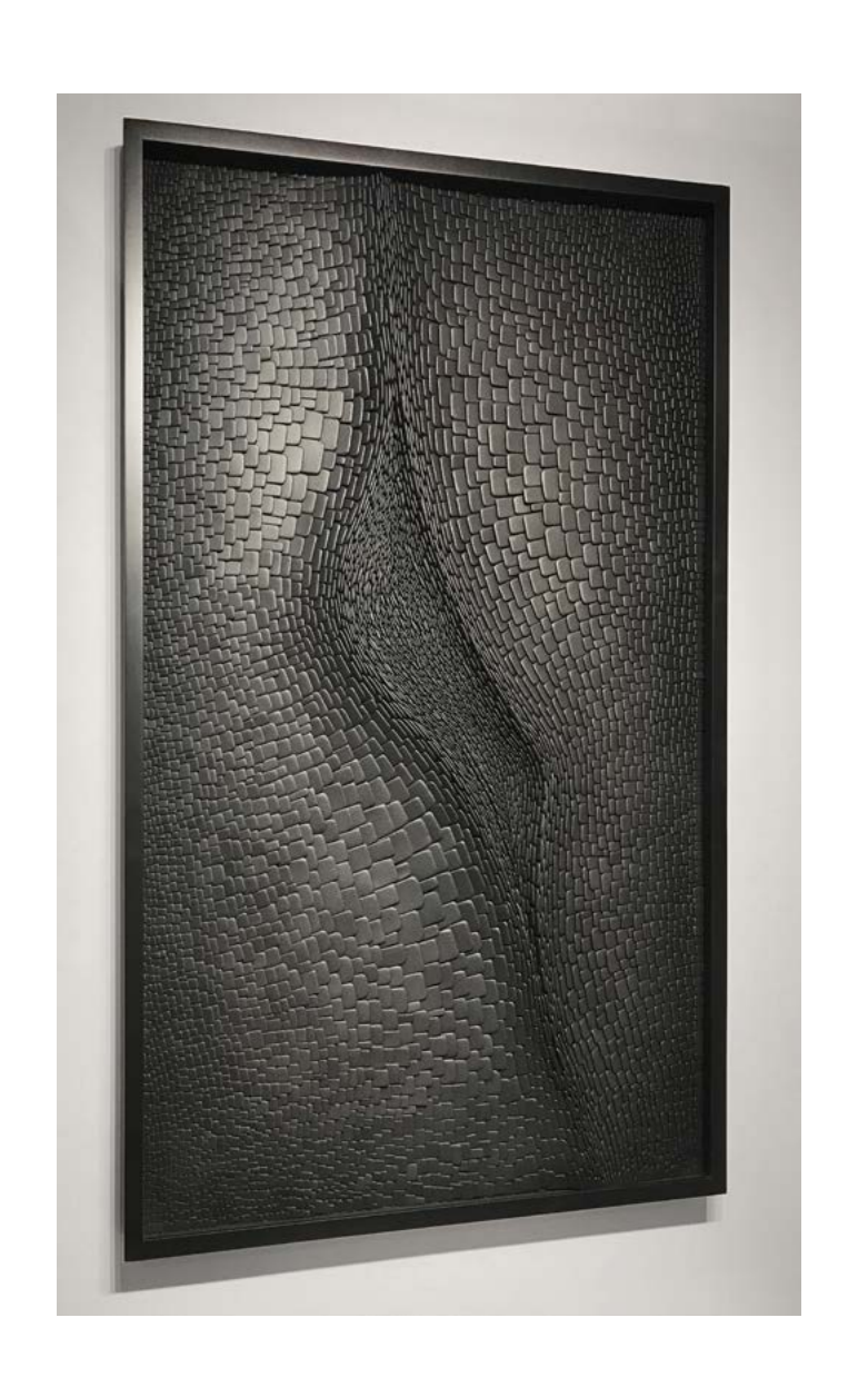
Justin Teilhet Composition #9, 2021 Black porcelain, oxidation fired 30 x 48 inches