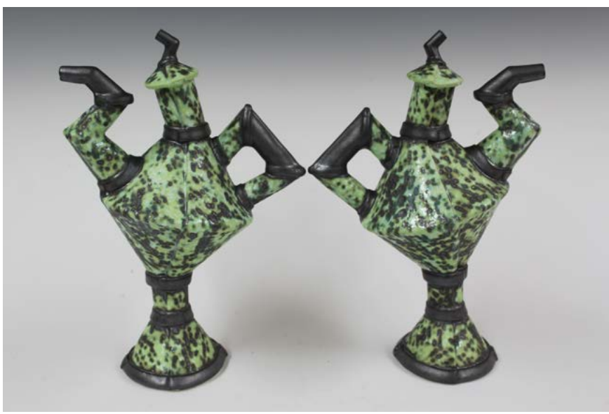
Scott Dooley Two Teapots, 2020 Handbuilt porcelain with cone 5 oxidation 12 x 16 x 6 inches