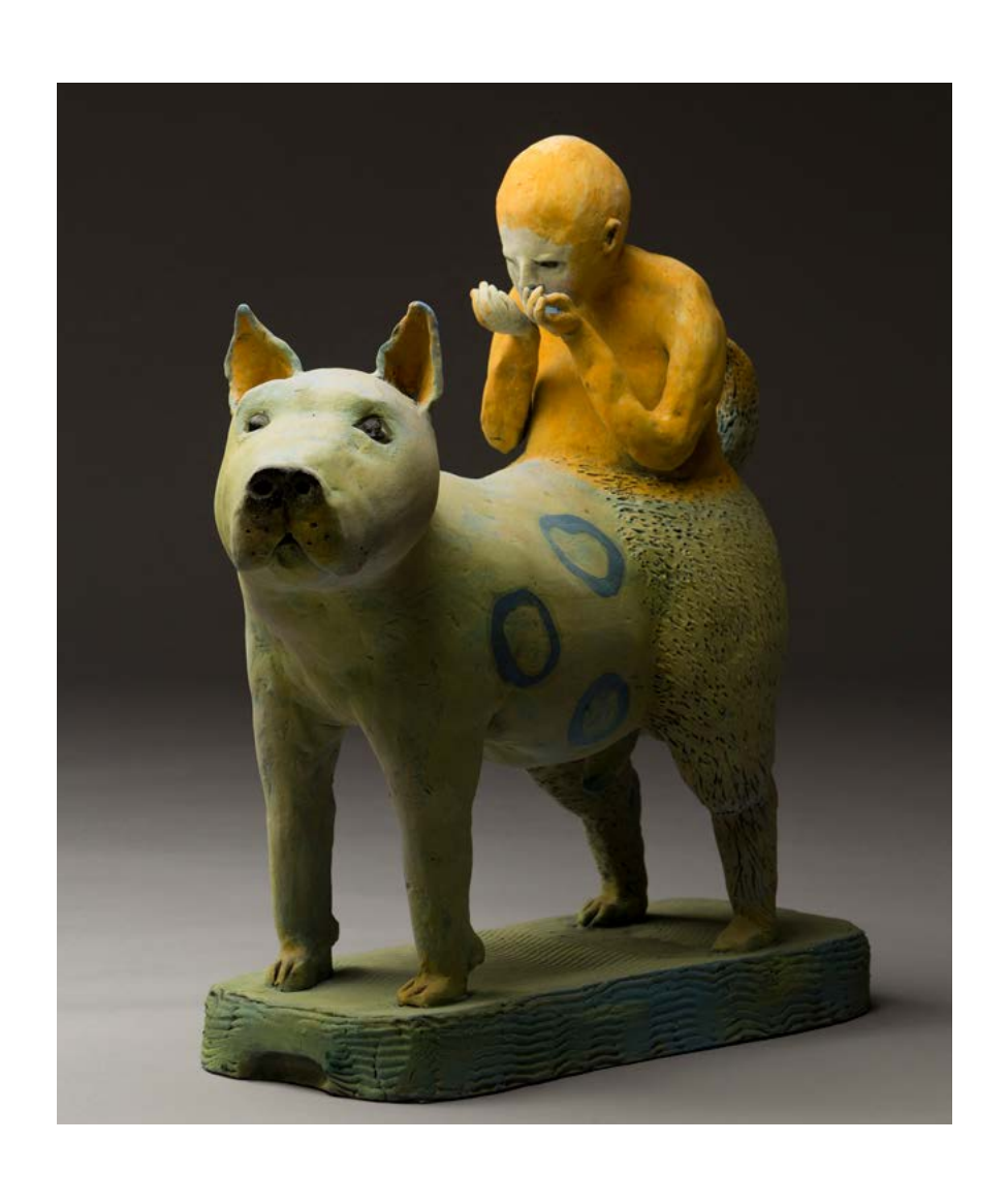
Juliellen Byrne Seeing Eye God, 2015 Ceramic, electric fired at various temperatures 24 x 26 x 9 inches