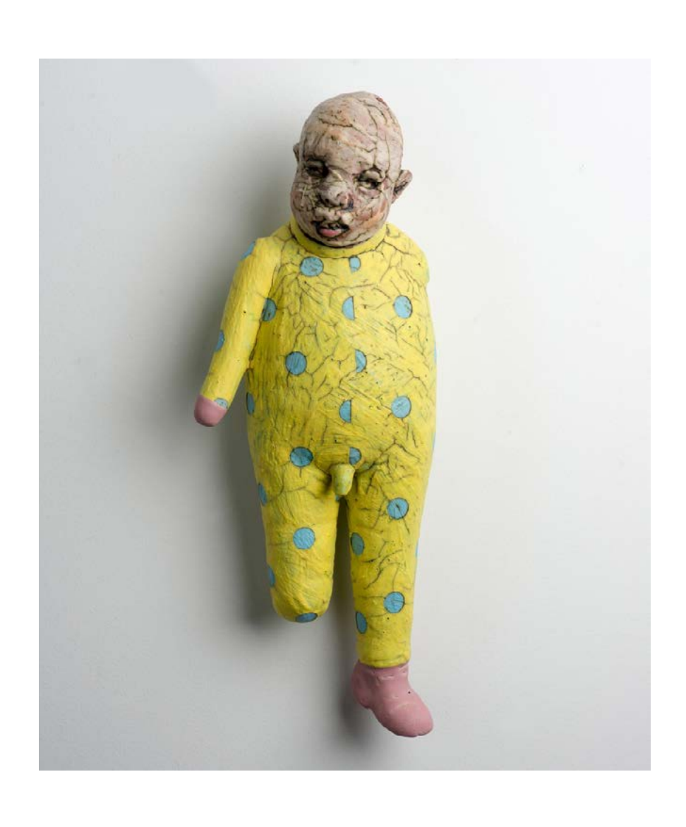
Tom Bartel Stumpy, 2012 Multi-fired earthenware with cone 04 oxidation 21 \times 9 \times 12 inches