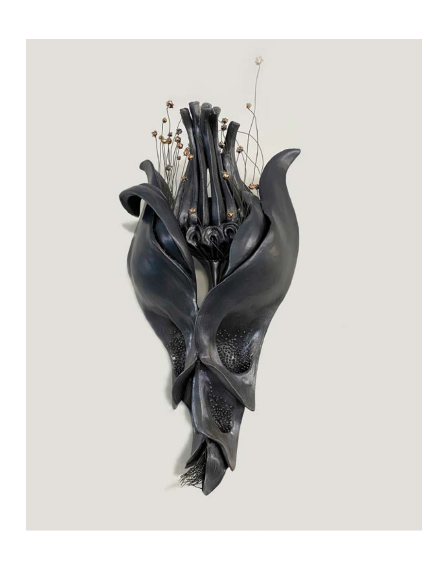
Carrie Longley Geum rivale, 2020 Handbuilt porcelain with low fired glaze and high temperature wire 12 x 6 x 5 inches