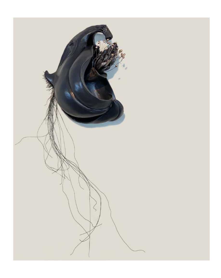
Magnolia grandiflora, 2020 Handbuilt porcelain with low fired glaze and high temperature wire 10 x 6 x 5 inches