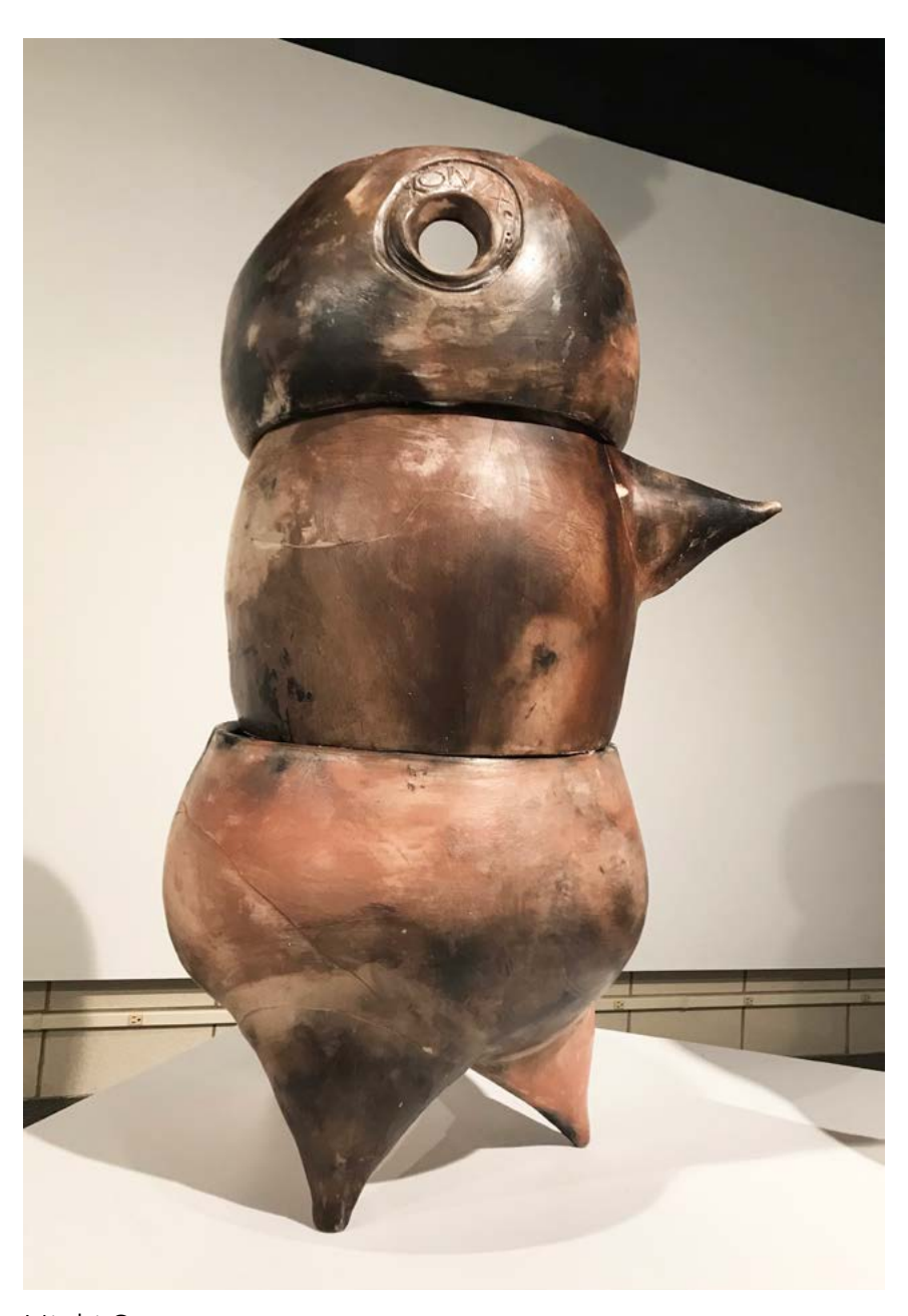
Nicki Strouss Time Out Jar, 2020