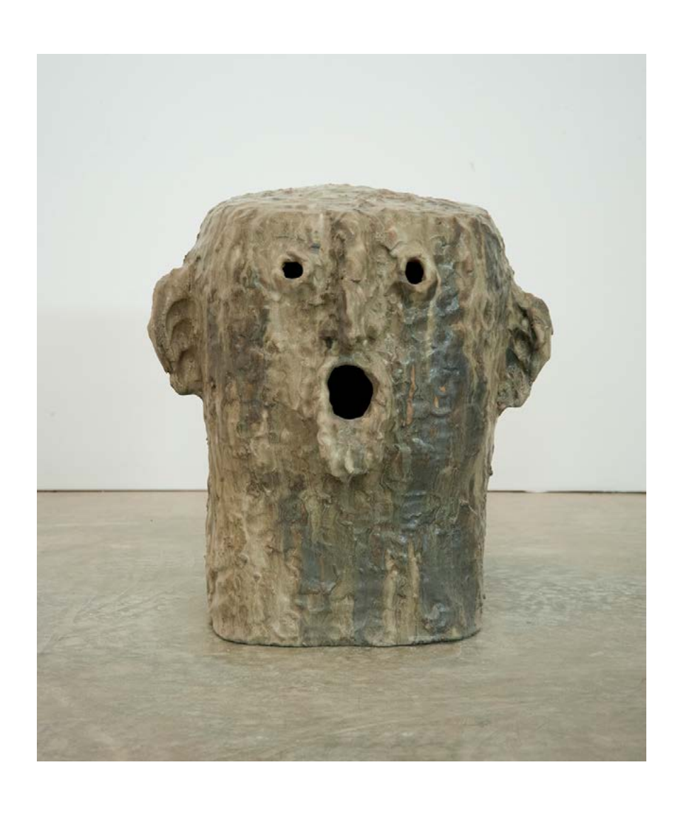
Matt Wedel Portrait, 2020 Stoneware, cone10 oxidation 22 x 19 x 20 inches