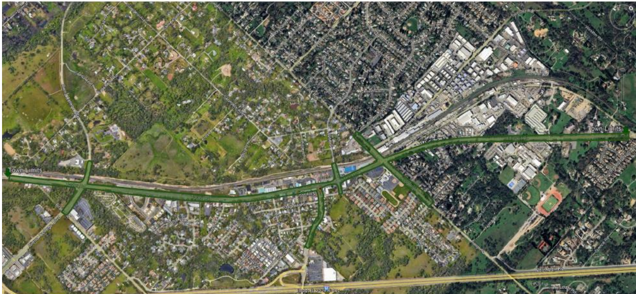
EXHIBIT- A TAYLOR ROAD CORRIDOR STUDY LIMITS

The Town released the Taylor Road Corridor Study in early July 2024. The goal is to have a consultant onboard in August to perform the traffic/intersection treatment analyses. The project complies with Council Goals Initiative #3 and #7.