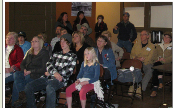
Community Meeting #2