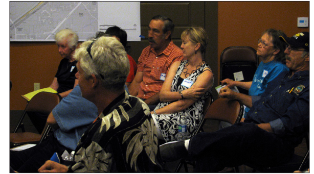
Steering Committee Meeting #1