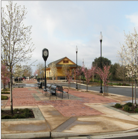
Refurbished Loomis Train Depot and Multi-Modal Transportation Center