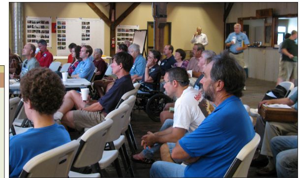
Community Meeting #1