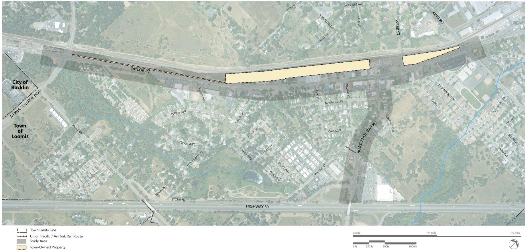
FIGURE 1.1 - PROJECT STUDY AREA