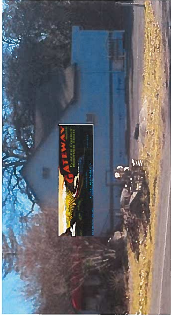
Taylor Rd. Horse & Buggy Consignment