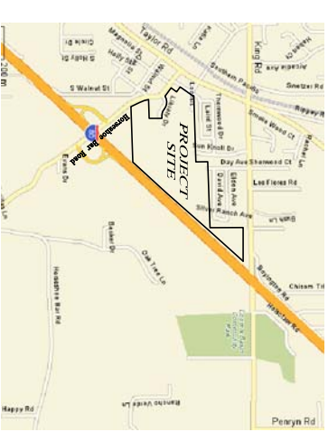
VICINITY MAP MS