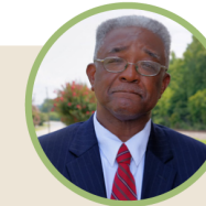
COUNCILMEMBER Thomas Gillespie Mayor Pro-Tem