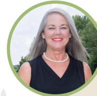
MAYOR Sandy Railey