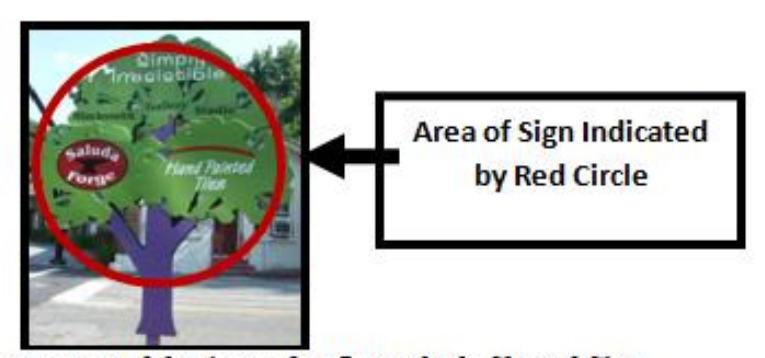
Example Illustrating Measurement of the Area of an Irregularly Shaped Sign

SIGN AREA . The size of a sign in square feet as computed by the area of not more than two standard geometric shapes (specifically circles, squares, rectangles, or triangles) that encompass the shape of the sign exclusive of the supporting structure.