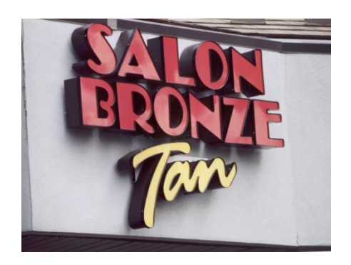
Example of Channel Lettering

CHANNEL LETTERING. A sign design technique involving the installation of three-dimensional lettering against a background, typically a sign face or building façade.