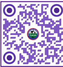
Scan to visit the Lucas Farmers Market webpage

Join the Lucas Farmers Market community on May 24 as we host an animal adoption and education event at Lucas Community Park. Show up with a spare collar, donations of dry pet food for local shelters, and questions for the Lucas Veterinary Hospital! Come find your next loyal companion and save a life!