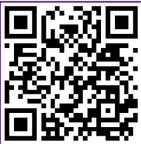
Scan to visit the Lucas Farmers Market Facebook page

Join us this summer for the City of Lucas Farm to Table Markets! Enjoy fresh, locally grown produce and farm fresh meats while supporting our local farmers and small businesses.