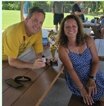
2nd Place: The Bierman Family Salted Caramel Cheesecake