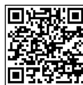
City of Lucas, Texas 4K likes • 5K followers