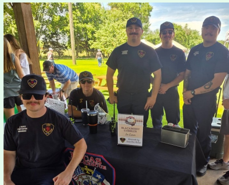
3rd Place: Lucas Fire-Rescue Blackberry Cobbler