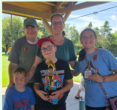
1st Place: The Fisher Family Chocolate Mint