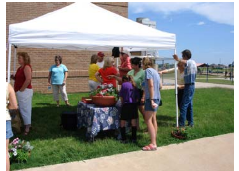
Parks & Open Space members give away trees to citizens at the Lucas Country Parade

Now that the Master Plan has been approved by City Council, it has been sent to the Texas Parks and Wildlife Department's Grant Branch in Austin for their review. This lays the groundwork for the Parks and Open Spaces Board to start pursuing grants that will help the City achieve it's commitment to improvement of recreational facilities and acquisition and preservation of open spaces.