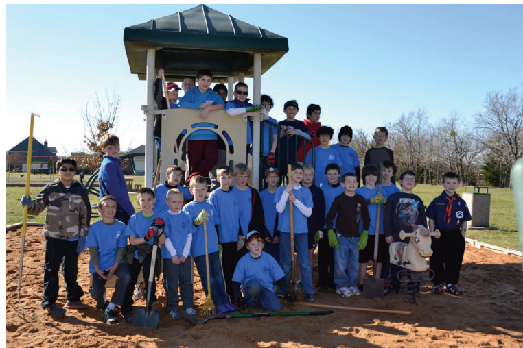
Cub Scout Pack 358 at Hart Elementary completed their service project with the City of Lucas Parks Department on Saturday, February 25 th at Forest Creek Park. The boys did litter patrol throughout the park and spread new sand at the two playground structures.