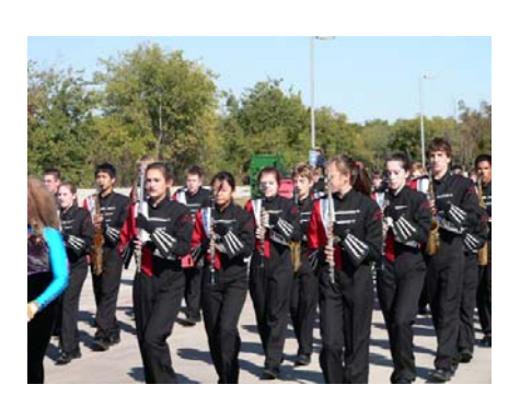
Lovejoy High School Band