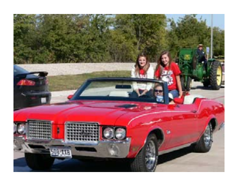
Classic Car Fun