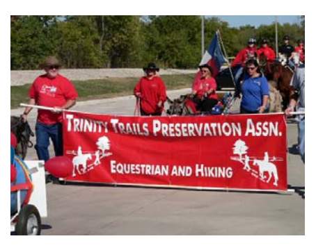
Trinity Trails Preservation Association