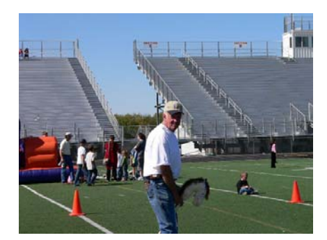
Mayor Bill Carmickle