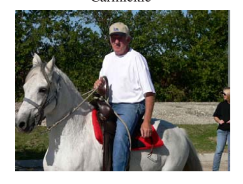
Mayor Bill Carmickle