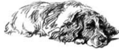
"1000 Dogs in 2007"

You can also contact our local veterinarian at Lucas Veterinary Hospital , 972-727-8446 for a list of local rescue groups.