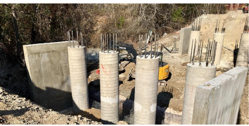
West Bridge Retaining Walls and Drill Shaft Columns