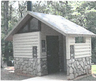
Bathroom or similar by others