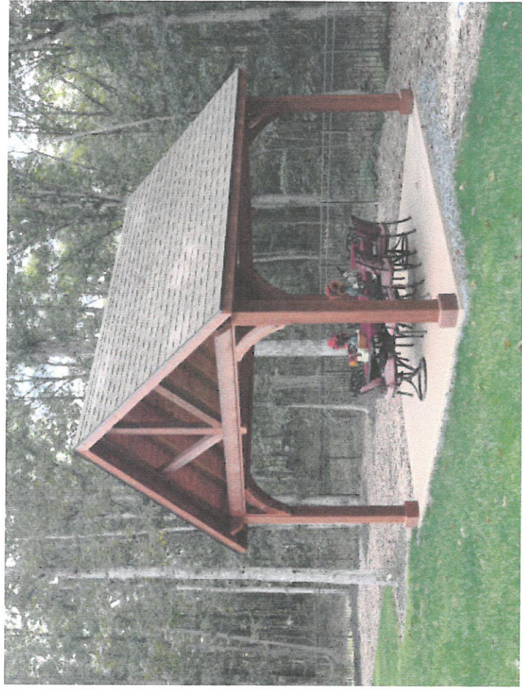
Cedar pavilion or similar