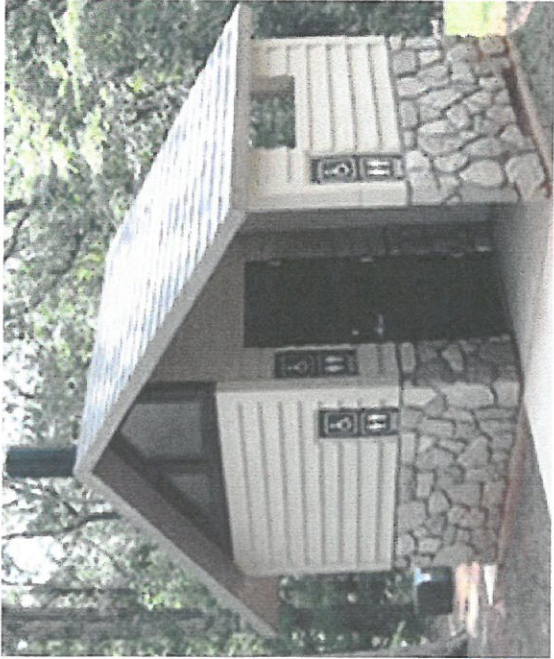
Bathroom or similar by others