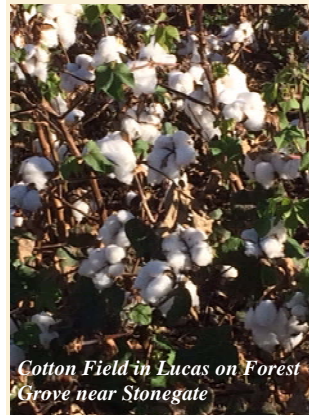
Cotton Field in Lucas on Forest Grove near Stonegate

Driving around Lucas, I have enjoyed so many wonderful fall sights. The trees are dressed in the most majestic, brilliant colors. The Chinese Pistaches are sharing vibrant colors ranging from burgundy to flaming scarlet and orange. The sweet gum trees have provided a golden hue to the view. Fiery maples have been at their finest. The colors of all the trees this year are vast in their range of colors and intensity – a feast for the eyes and the soul!