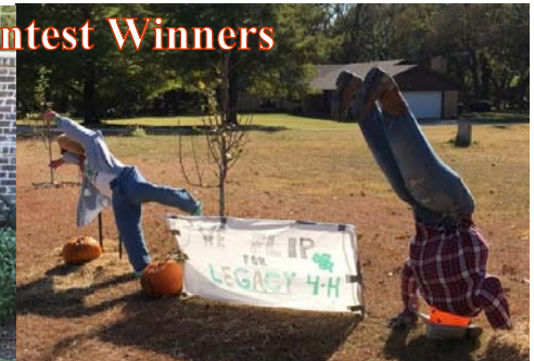
Organization Entry Winner - We Flip for Legacy 4-H

We hope that everyone was able to take the Scarecrow Tour around town to see all the entries that participated in the 3rd Annual Scarecrow Contest sponsored by the Parks and Open Space Board. The first place winner for the Individual category was "Porch Time in the Fall" located at 1110 Snider. The first place winner in the Organization/Business category was "We Flip for Legacy 4-H". Thank you to all who participated in this fun event.