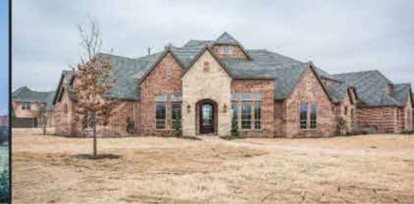
765 Kenwood Trail, Lucas List Price: $968,500