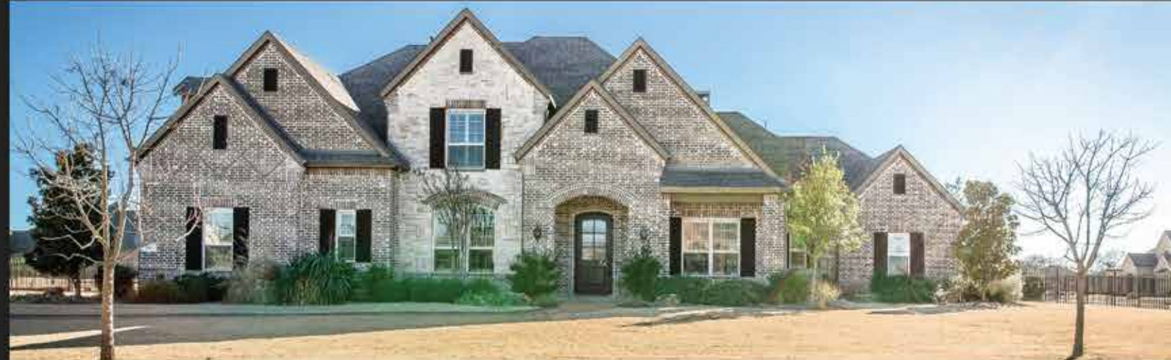
611 Connell Lane, Lucas Elegance & Grace, 5,085 sq. ft. (per tax rolls), on 1 Acres 5 Bedrooms / 4 Full Baths / 1 Half Bath / 3 Living Areas / Fireplace / 2 Dining Areas Study/ Game Room / Media Room / Pool and Outdoor Living Area / 3 Car Garage $875,000