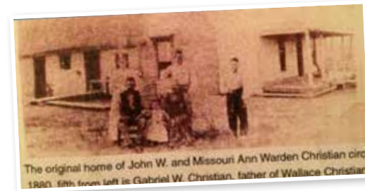
Christian homestead 1880