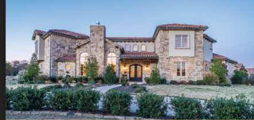
723 Bending Oak Trail, Fairview List Price: $2,200,000