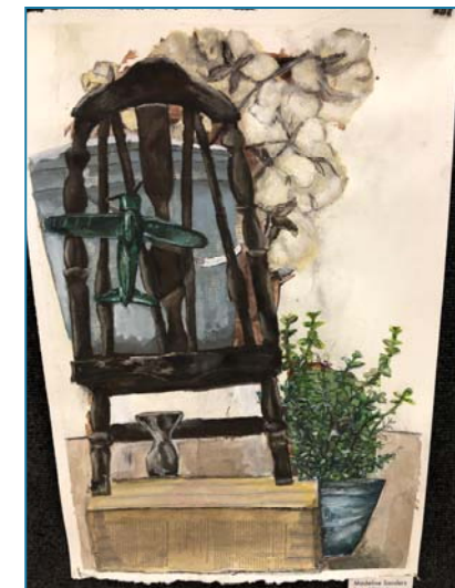
Painting by Madeline Sanders of Lovejoy High School

The City adopted what is termed a dark sky ordinance requiring all light fixtures installed after January 1, 2008 to be a full cut-off light fixture. A full cut-off operates at a forty-five-degree angle directed toward the ground to limit the amount of lighting that protrudes outward. Fixtures that do not meet this standard must be turned off before midnight, unless it is essential for security lighting. As a courtesy to neighbors, please use caution to ensure your security and landscape lighting is not "trespassing" on neighboring property. Should you have any questions regarding security or landscape lighting trespassing from other properties, please contact Code Enforcement at 972.912.1206 or aaguinaga@lucastexas.us . The City also does not require street lights unless the street lights are deemed essential by the City Engineer for safety purposes. This is another way to assist in maintaining natural dark skies in Lucas. If you have any questions regarding the need for street lights in your neighborhood, contact City Engineer Stanton Foerster at 972.912.1208 or sfoerster@lucastexas.us .