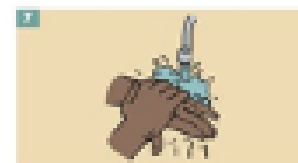
Clean your hands immediately after removing gloves.