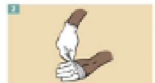
Peel the glove away from your body, pulling it inside out.