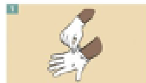
Grip the outside of one glove at the wrist. Do not touch your bare skin.