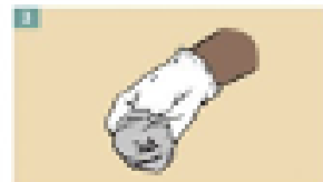
Cup the glove you just removed in your gloved hand.