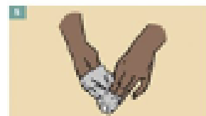
Peel the second glove inside out while pulling it away from your body, keeping the first glove inside the second.